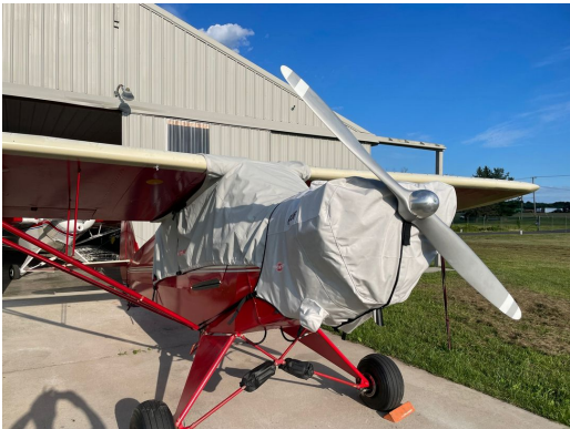
Piper J3 Cub Travel Weight Canopy & Engine Cover