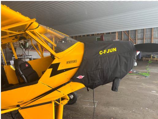
Piper J3 Cub Insulated Engine Cover