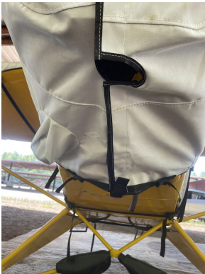
Piper J-3C-65 Cub Engine Cover, Fully Enclosed