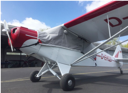
Piper Super Cub Travel Weight Canopy Cover

This cover type is made from Silver Acrylic Sunbrella canvas and is 100% lined with a soft and smooth microfiber. Bruce's Custom Covers developed this material combination especially for aircraft protection. The outer material is medium weight and treated for water resistance, UV resistance and anti-static buildup. The inner lining is a very soft and smooth microfiber to prevent scratching. The material is very reflective, and tests show that the cabin interior temperature can be reduced to near-ambient temperature on the hottest of days. It is water, ice and snow repellent, yet breathable to allow moisture to escape from between the cover and the aircraft surface.