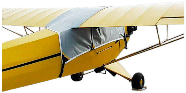
Piper J3 Over-Top Canopy Cover