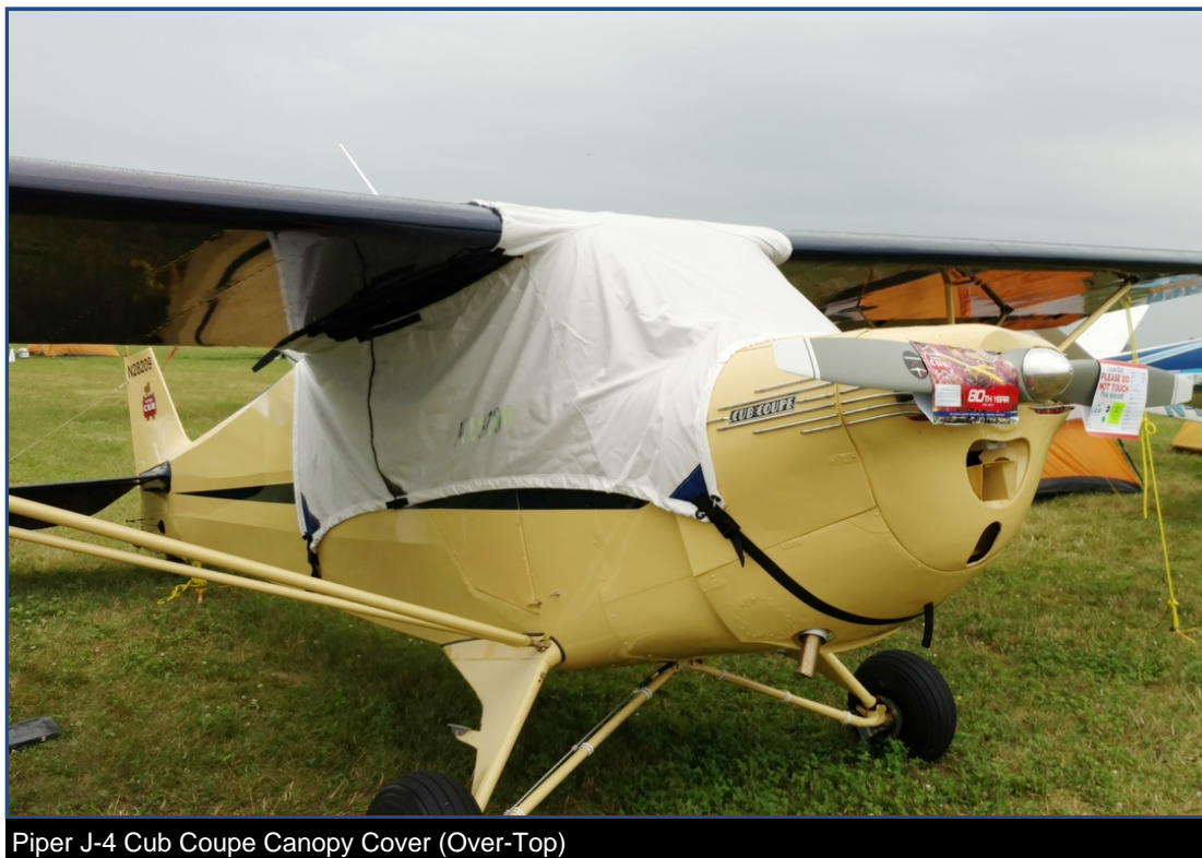
Piper J-4 Cub Coupe Canopy Cover (Over-Top)