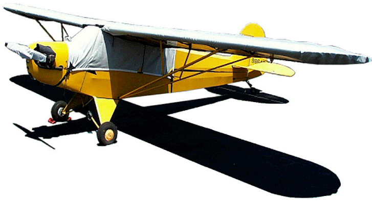
Piper J3 Canopy, Wing and Prop Covers