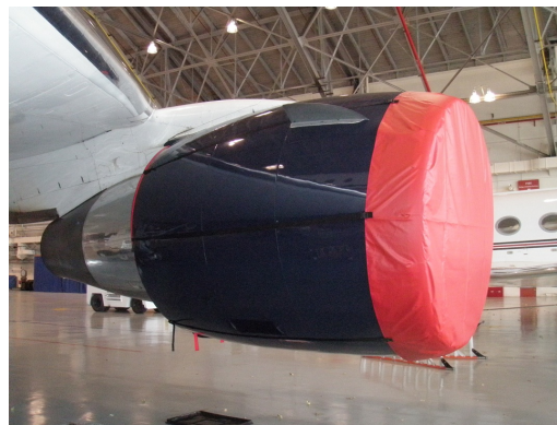
Boeing 767 Intake Covers Ship Set