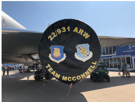
Boeing KC-46 Intake Cover