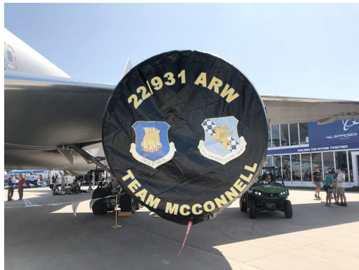
Boeing KC-46 Intake Cover