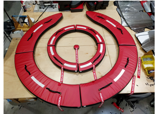
Boeing 747-8 Exhaust Plugs