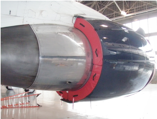
Boeing 767 Exhaust Plugs Ship Set, incl. Fan Thrust Reverser and Exhaust Plugs P/N: B767-200

The Engine Inlet Plugs are custom fit for your Boeing KC-46, KC-46A, Pegasus intakes, made with heavy-duty vinyl material, and stuffed with a single block of sculpted urethane foam. Each plug has a zipper that allows the foam to be removed and dried if necessary. Engine plugs have 'remove before flight' streamers sewn onto the face of the plugs. Most plugs are imprinted with the aircraft registration number in black for an extra charge. Storage bag NOT included. Engine plugs may be inserted after flight when the engine is still warm. Engine Inlet Plugs are commonly referred to as Cowl Plugs, Intake Plugs, Cowl Blocks, Engine Blocks, and Engine Bungs.