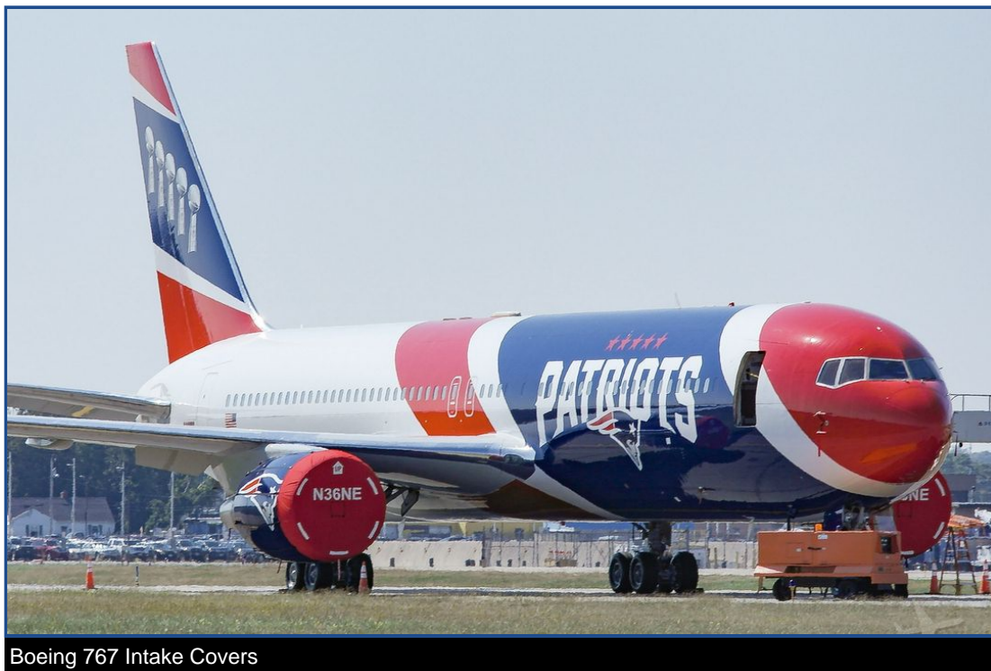
Boeing 767 Intake Covers