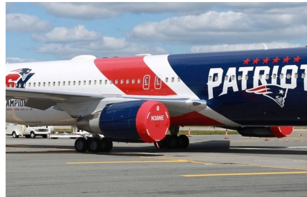
Boeing 767 Intake Covers