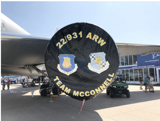
Boeing KC-46 Intake Cover