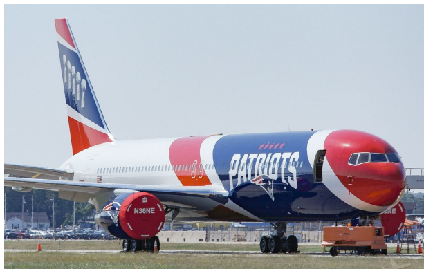
Boeing 767 Intake Covers