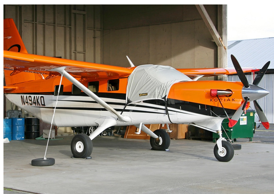
Quest Kodiak Windshield Cover, Prop Tie/Exhaust Covers, Engine Inlet Plugs & Pitot Cover