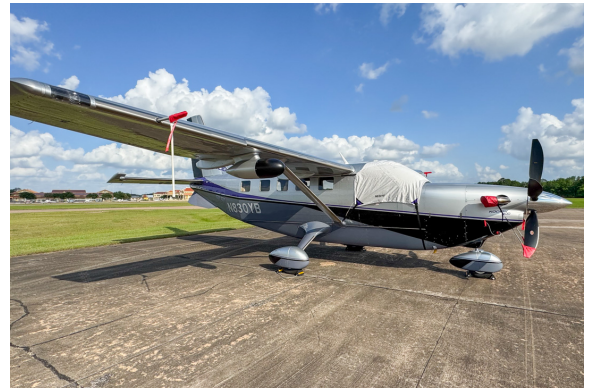
Quest Kodiak Windshield Cover, Prop Tie/Exhaust Covers, Engine Inlet Kodiak 200 Cockpit Cover, Pitot Cover, Prop Tie/Exhaust Plugs & Pitot Cover