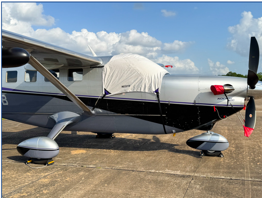
Kodiak Aircraft Co Inc KODIAK 200 Cockpit Cover