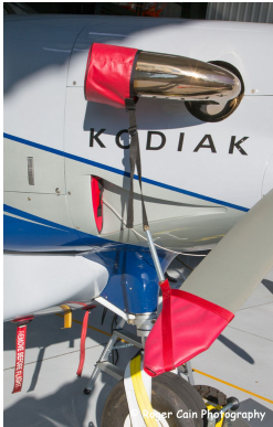
Quest Kodiak Engine Plugs, Prop Tie-Down & Exhaust Covers Quest Kodiak Engine Plugs, Prop Tie-Down & Exhaust Covers