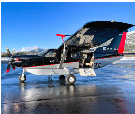
Quest Kodiak Prop Tie/Exhaust Covers & Pitot Covers