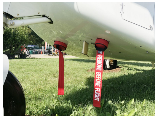
Quest Kodiak Lower Cowling Bypass Duct Plugs