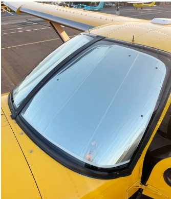
Quest Aircraft Kodiak Cockpit Heatshields