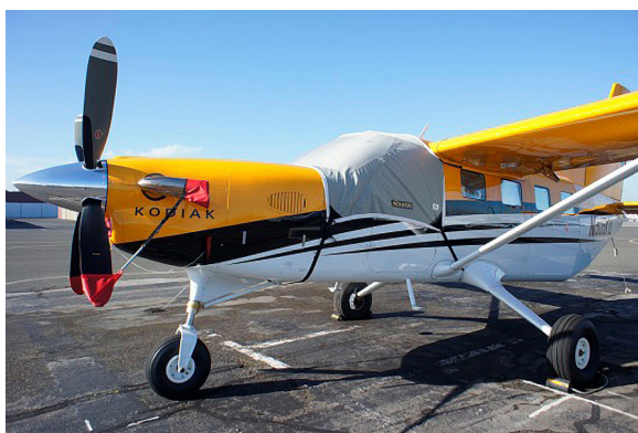
Quest Kodiak Cockpit Cover, Engine Plugs, Prop Tie/Exhaust Covers, & Cabin HeatShields set

This cover type is made from Silver Acrylic Sunbrella canvas and is 100% lined with a soft and smooth microfiber. Bruce's Custom Covers developed this material combination especially for aircraft protection. The outer material is medium weight and treated for water resistance, UV resistance and anti-static buildup. The inner lining is a very soft and smooth microfiber to prevent scratching. The material is very reflective, and tests show that the cabin interior temperature can be reduced to near-ambient temperature on the hottest of days. It is water, ice and snow repellent, yet breathable to allow moisture to escape from between the cover and the aircraft surface.