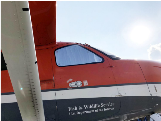
Quest Kodiak Cockpit HeatShields

Cockpit Heatshields are interior sunshades for the aircraft's cockpit. The product is a unique composite of closed-cell foam with a silver mylar finish. The semi-rigid design is stiff enough to stand inside the window framing. The set folds up flat and is easily stored in the included storage sleeve. Some designs may require velcro and suction cups. A Heatshield is an excellent short-term remedy for cockpit overheating, but an external fabric cover is more effective for long-term protection.