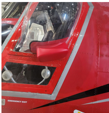
Boeing Vertol CH-47 Logger Window Plug

The Engine Inlet Plugs are custom fit for your Kaman KMAX intakes, made with heavy-duty vinyl material, and stuffed with a single block of sculpted urethane foam. Each plug has a zipper that allows the foam to be removed and dried if necessary. Engine plugs have 'Remove Before Flight' streamers sewn onto the face of the plugs. Most plugs are imprinted with the aircraft registration number in black for an extra charge. Storage bag NOT included. Engine plugs may be inserted after flight when the engine is still warm. Engine Inlet Plugs are commonly referred to as Cowl Plugs, Intake Plugs, Cowl Blocks, Engine Blocks, and Engine Bungs.