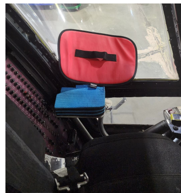
Boeing Vertol CH-47 Logger Window Plug