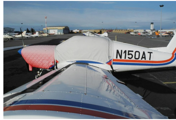
Koliber 150A Canopy Cover, Insulated Engine Cover