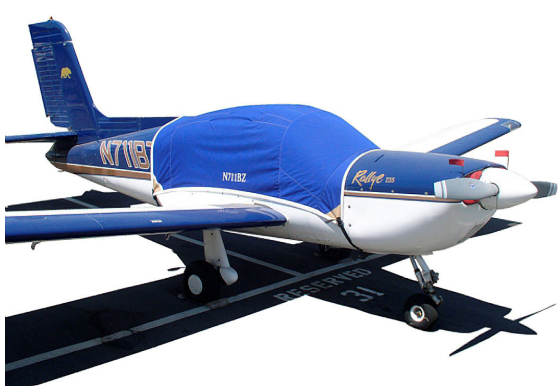
Rallye Canopy Cover