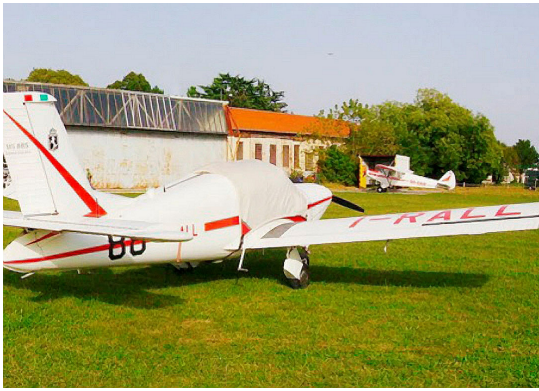
Standard Canopy Cover for MS893A