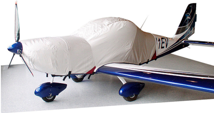
Ekvork Sportstar Extended Canopy/Engine Cover

This cover type is made from Silver Acrylic Sunbrella canvas and is 100% lined with a soft and smooth microfiber. Bruce's Custom Covers developed this material combination especially for aircraft protection. The outer material is medium weight and treated for water resistance, UV resistance and anti-static buildup. The inner lining is a very soft and smooth microfiber to prevent scratching. The material is very reflective, and tests show that the cabin interior temperature can be reduced to near-ambient temperature on the hottest of days. It is water, ice and snow repellent, yet breathable to allow moisture to escape from between the cover and the aircraft surface.