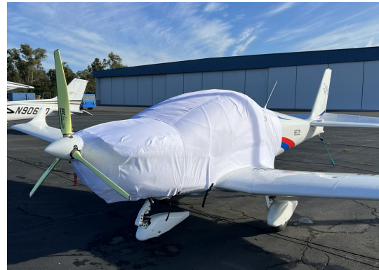
Jihlavan JA-600 Skyleader Extended Canopy/Engine Cover, test fit cover