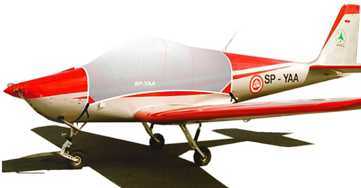
Kappa KP-5 Canopy Cover (illustration)