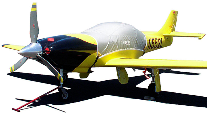
Canopy Cover for Lancair Legacy