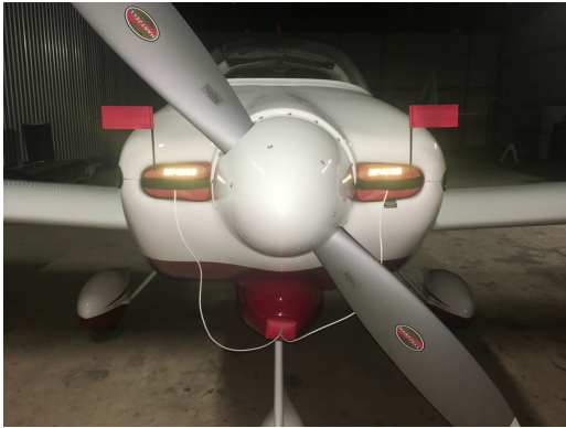
Van's Aircraft RV-7A Engine Inlet Plugs

Engine Inlet Plugs are custom fit for your Rand-Robinson KR-2 intakes, made with heavy-duty vinyl material, and stuffed with a single block of sculpted urethane foam. Each plug has a zipper that allows the foam to be removed and dried if necessary. Engine plugs have warning flags that are visible from the cockpit or 'remove before flight' streamers sewn onto the face of the plugs. Most plugs are imprinted with the aircraft registration number in black for an extra charge. Storage bag NOT included. Engine plugs may be inserted after flight when the engine is still warm. Engine Inlet Plugs are commonly referred to as Cowl Plugs, Intake Plugs, Cowl Blocks, Engine Blocks, and Engine Bungs.