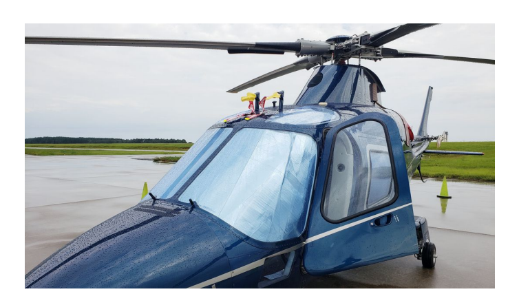
Agusta AW109S/SP Grand Heatshield Set