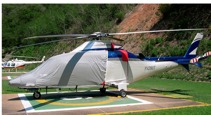
Agusta Grand Bubble Cover