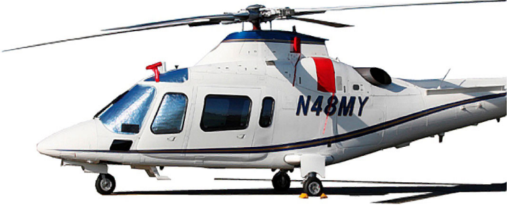
Agusta Power Intake Cover