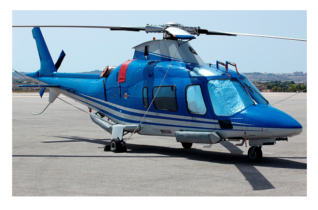
Agusta Power Cockpit HeatShields & Blade Tie-downs