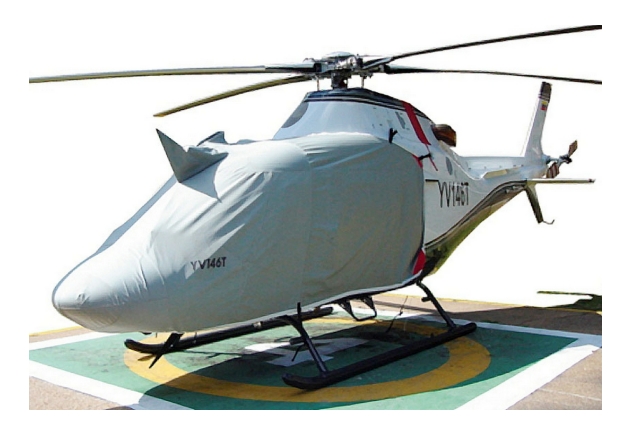
Koala Bubble Cover (with Wire Strike)