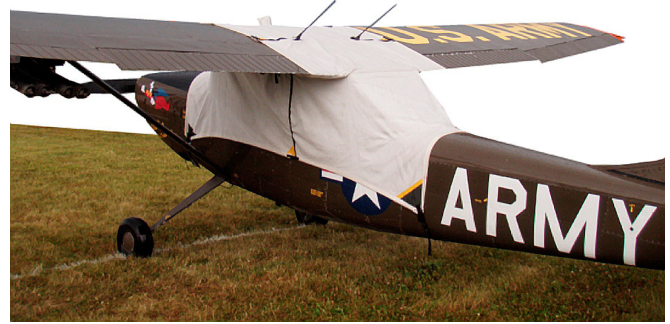
Cessna L-19 Extended Over-the-top Canopy, Engine, Empennage & Wing Covers