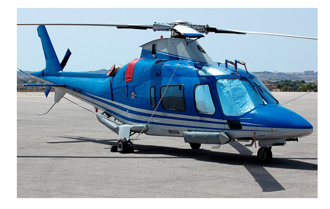
Agusta Power Cockpit HeatShields & Blade Tie-downs

Cabin Heatshields are interior sunshades for the aircraft's passenger cabin area. The product is a unique composite of closed-cell foam with a silver mylar finish. The semi-rigid design is stiff enough to stand inside the window framing. The set folds up flat and is easily stored in the included storage sleeve. Some designs may require velcro and suction cups. A Heatshield is an excellent short-term remedy for cockpit overheating, but an external fabric cover is more effective for long-term protection.