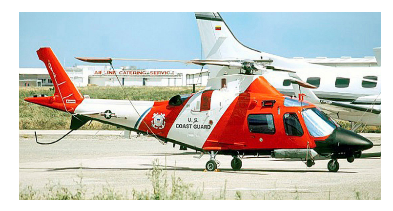
Covers, Plugs, HeatShields and related items for the Agusta MH-68A