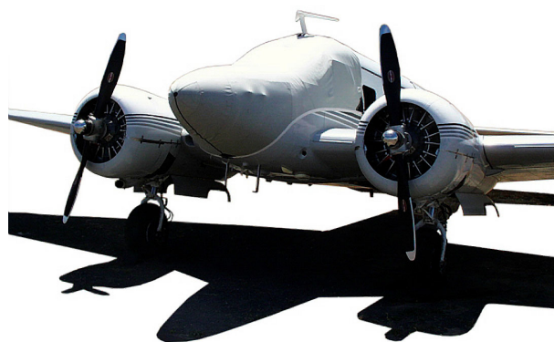
Beech 18 Cockpit/Nose Cover