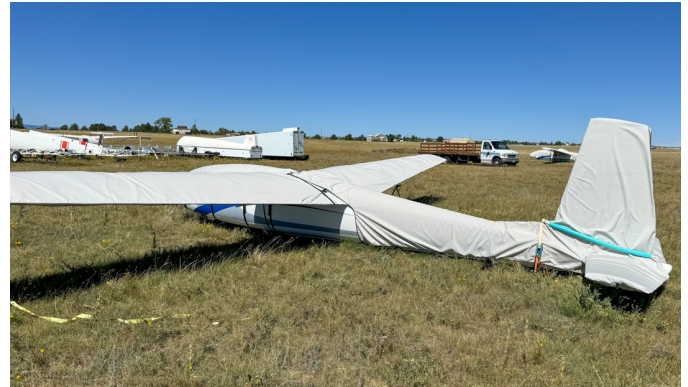
LET Blanik L-13 Empennage & Wing Covers