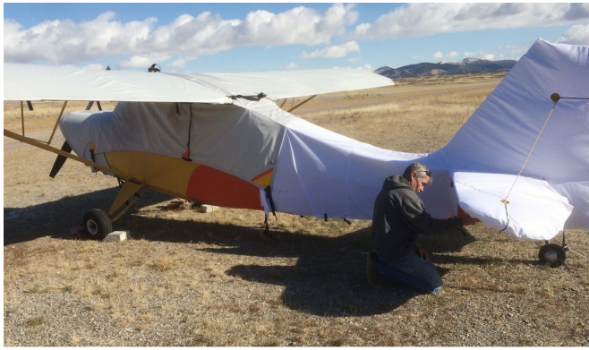
Aeronca Champ Canopy, Wings, Engine & Empennage (test fit) Covers