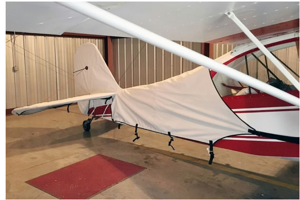
Aeronca Champ 7AC/7EC Empennage Cover