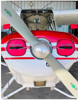
Aeronca 7AC Engine Inlet Plugs