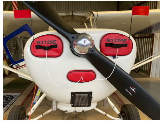
Aeronca Champ Engine Plugs