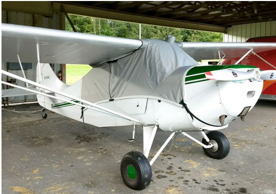
Aeronca Champ Light Weight Travel Canopy Cover, Over-Top Style

This cover type is made from Silver Acrylic Sunbrella canvas and is 100% lined with a soft and smooth microfiber. Bruce's Custom Covers developed this material combination especially for aircraft protection. The outer material is medium weight and treated for water resistance, UV resistance and anti-static buildup. The inner lining is a very soft and smooth microfiber to prevent scratching. The material is very reflective, and tests show that the cabin interior temperature can be reduced to near-ambient temperature on the hottest of days. It is water, ice and snow repellent, yet breathable to allow moisture to escape from between the cover and the aircraft surface.