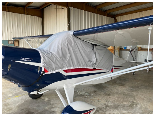
Aeronca Champ Travel Weight Canopy Cover

This cover type is made from Silver Acrylic Sunbrella canvas and is 100% lined with a soft and smooth microfiber. Bruce's Custom Covers developed this material combination especially for aircraft protection. The outer material is medium weight and treated for water resistance, UV resistance and anti-static buildup. The inner lining is a very soft and smooth microfiber to prevent scratching. The material is very reflective, and tests show that the cabin interior temperature can be reduced to near-ambient temperature on the hottest of days. It is water, ice and snow repellent, yet breathable to allow moisture to escape from between the cover and the aircraft surface.