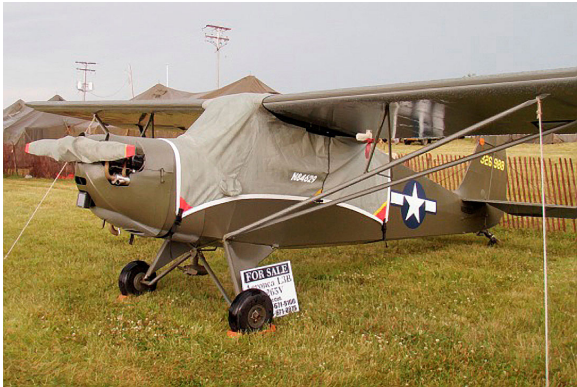
Aeronca 7AC Champ Canopy & Prop Covers