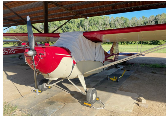
Aeronca Champ Over-Top Canopy Cover, Engine Plugs