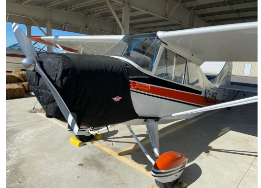
Aeronca Champ 7AC Insulated Engine Cover