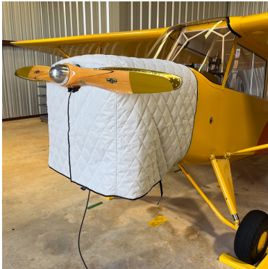
Aeronca 7AC Insulated Hangar Blanket, interior use