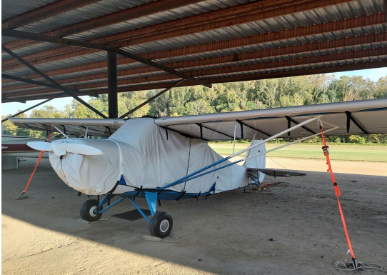
Aeronca Champ 7AC Extended Canopy, Engine, Wings & Empennage Covers

This cover type is made from Silver Acrylic Sunbrella canvas and is 100% lined with a soft and smooth microfiber. Bruce's Custom Covers developed this material combination especially for aircraft protection. The outer material is medium weight and treated for water resistance, UV resistance and anti-static buildup. The inner lining is a very soft and smooth microfiber to prevent scratching. The material is very reflective, and tests show that the cabin interior temperature can be reduced to near-ambient temperature on the hottest of days. It is water, ice and snow repellent, yet breathable to allow moisture to escape from between the cover and the aircraft surface.