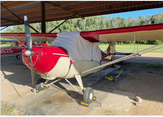
Aeronca Champ Over-Top Canopy Cover, Engine Plugs