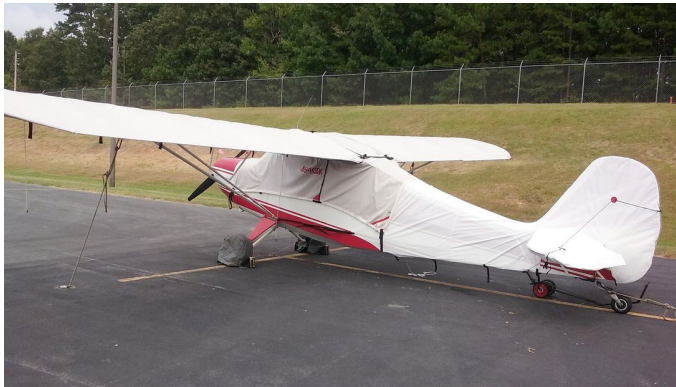
Aeronca Champ 7AC Empennage Cover, test fit

WINTER USE MATERIAL - Made with Solution-Dyed Polyester fabric, this option is intended for seasonal use to aid in deicing, rain mitigation, or for occasional travel. The material is lighter and more compact, but more susceptible to UV damage and may have a shorter useful life if used continuously outside than the all-year use material.