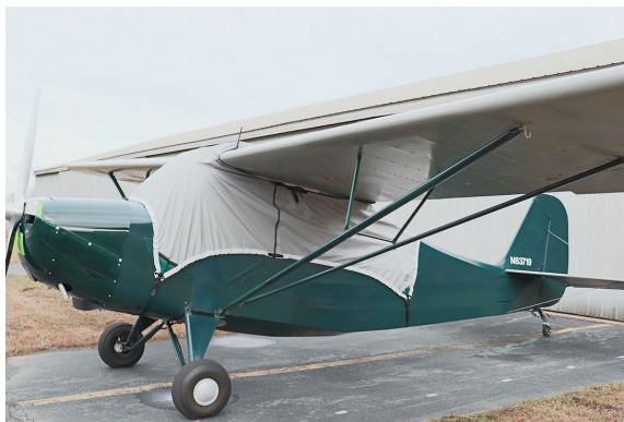
Aeronca 7AC Over-Top Canopy Cover, Light Weight Travel Type