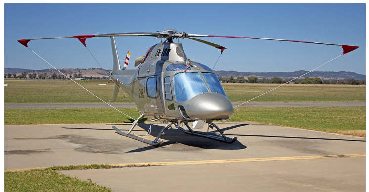
Agusta 119 Cockpit/Cabin HeatShields