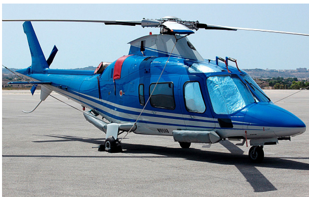
Agusta Power Cockpit HeatShields & Blade Tie-downs

Cabin Heatshields are interior sunshades for the aircraft's passenger cabin area. The product is a unique composite of closed-cell foam with a silver mylar finish. The semi-rigid design is stiff enough to stand inside the window framing. The set folds up flat and is easily stored in the included storage sleeve. Some designs may require velcro and suction cups. A Heatshield is an excellent short-term remedy for cockpit overheating, but an external fabric cover is more effective for long-term protection.