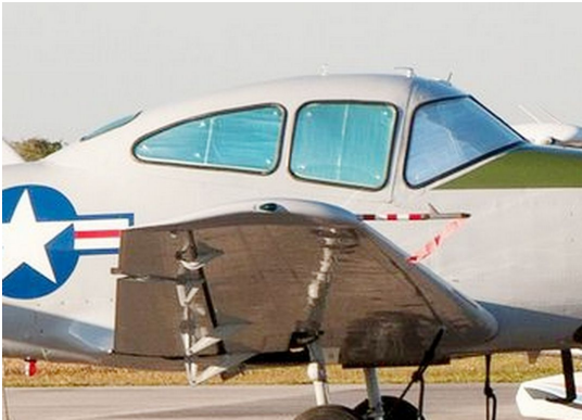
Navion L-17 Heatshield Set

Windshield Heatshields are interior sunshades for an aircraft's front windshield. The product is a unique composite of closed-cell foam with a silver mylar finish. The semi-rigid design is stiff enough to stand along the inside of the windshield using sun visors or window framing. It folds up flat and easily stores in the included storage sleeve. Some designs may require velcro and suction cups or split right and left sides. A Heatshield is an excellent short-term remedy for cockpit overheating. An external fabric cover is far more effective and practical for long-term protection.