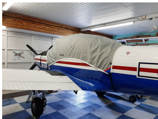
Navion L-17 Travel Cover, Light Weight Canopy Cover (w/without avionics bay extension)