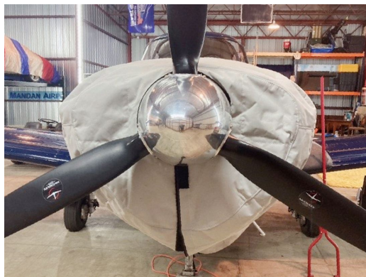
Navion Insulated Engine Cover