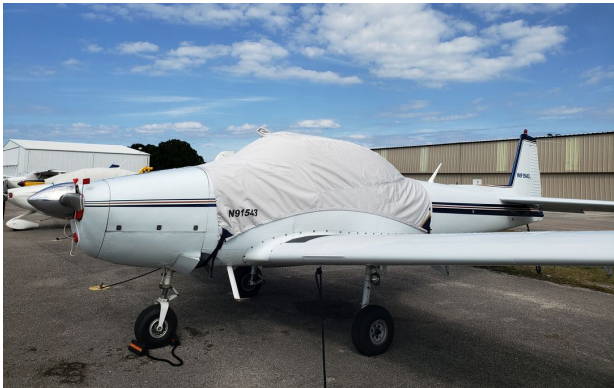
Ryan Navion Canopy Cover with Avionics Bay Extension