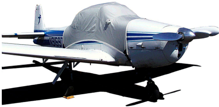
Navion Canopy Cover extends forward to firewall line.

This cover type is made from Silver Acrylic Sunbrella canvas and is 100% lined with a soft and smooth microfiber. Bruce's Custom Covers developed this material combination especially for aircraft protection. The outer material is medium weight and treated for water resistance, UV resistance and anti-static buildup. The inner lining is a very soft and smooth microfiber to prevent scratching. The material is very reflective, and tests show that the cabin interior temperature can be reduced to near-ambient temperature on the hottest of days. It is water, ice and snow repellent, yet breathable to allow moisture to escape from between the cover and the aircraft surface.