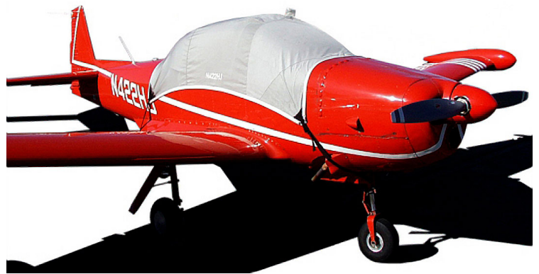
Navion Standard Canopy Cover on Long Slope Windshield Model