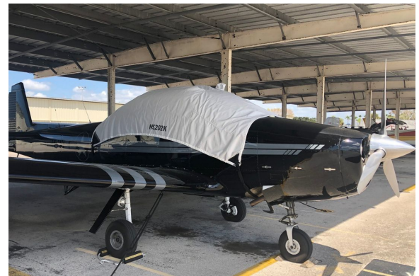
Navion L-17 Canopy Cover