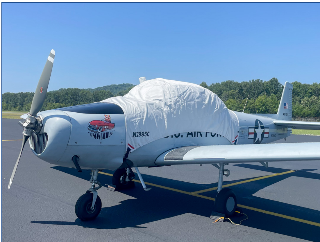
Navion L-17B Canopy Cover (With Avionics Bay Extension)