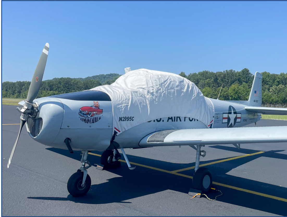
Navion L-17B Canopy Cover (With Avionics Bay Extension)