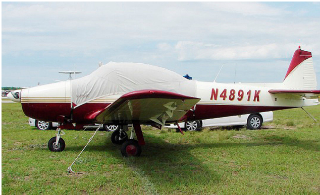
Navion Canopy Cover

This cover type is made from Silver Acrylic Sunbrella canvas and is 100% lined with a soft and smooth microfiber. Bruce's Custom Covers developed this material combination especially for aircraft protection. The outer material is medium weight and treated for water resistance, UV resistance and anti-static buildup. The inner lining is a very soft and smooth microfiber to prevent scratching. The material is very reflective, and tests show that the cabin interior temperature can be reduced to near-ambient temperature on the hottest of days. It is water, ice and snow repellent, yet breathable to allow moisture to escape from between the cover and the aircraft surface.