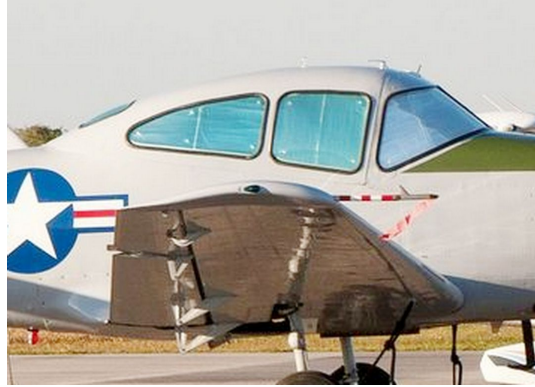
Navion L-17 Heatshield Set

Windshield Heatshields are interior sunshades for an aircraft's front windshield. The product is a unique composite of closed-cell foam with a silver mylar finish. The semi-rigid design is stiff enough to stand along the inside of the windshield using sun visors or window framing. It folds up flat and easily stores in the included storage sleeve. Some designs may require velcro and suction cups or split right and left sides. A Heatshield is an excellent short-term remedy for cockpit overheating. An external fabric cover is far more effective and practical for long-term protection.