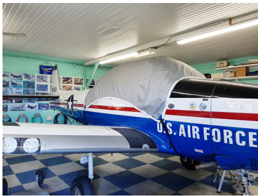
Navion L-17 Travel Cover, Light Weight Canopy Cover (w/out avionics bay extension)