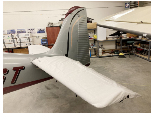
Navion Rangemaster Horizontal Stabilizer Covers