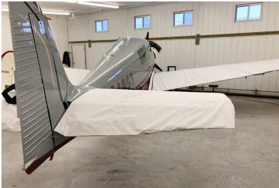
Navion Rangemaster Wing & Horizontal Stabilizer Covers