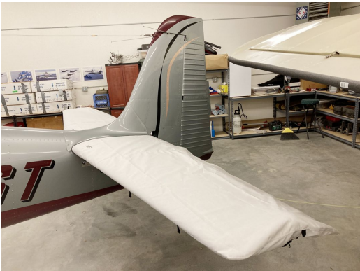
Navion Rangemaster Horizontal Stabilizer Covers

WINTER USE MATERIAL - Made with Solution-Dyed Polyester fabric, this option is intended for seasonal use to aid in deicing, rain mitigation, or for occasional travel. The material is lighter and more compact, but more susceptible to UV damage and may have a shorter useful life if used continuously outside than the all-year use material.