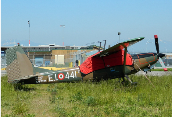
Cessna L-19 Bird Dog Canopy Cover

The material is very reflective, and tests show that the cabin interior temperature can be reduced to near-ambient temperature on the hottest of days. It is water, ice and snow repellent, yet breathable to allow moisture to escape from between the cover and the aircraft surface.