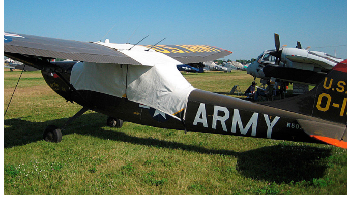
L-19 Canopy Cover