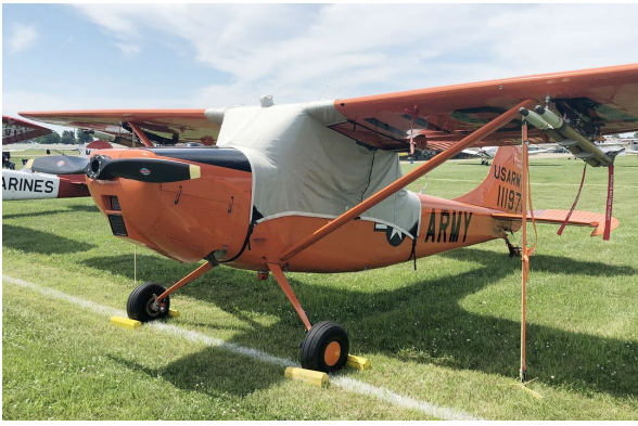
Cessna L-19 Bird Dog Canopy Cover