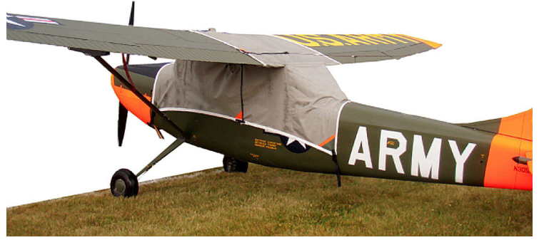
L-19 Canopy Cover