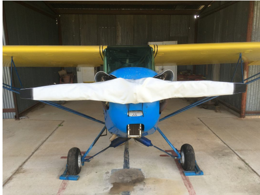
Taylorcraft L-2 Grasshopper Propellor/Spinner Cover

This cover type is made from Silver Acrylic Sunbrella canvas and is 100% lined with a soft and smooth microfiber. Bruce's Custom Covers developed this material combination especially for aircraft protection. The outer material is medium weight and treated for water resistance, UV resistance and anti-static buildup. The inner lining is a very soft and smooth microfiber to prevent scratching. The material is very reflective, and tests show that the cabin interior temperature can be reduced to near-ambient temperature on the hottest of days. It is water, ice and snow repellent, yet breathable to allow moisture to escape from between the cover and the aircraft surface.