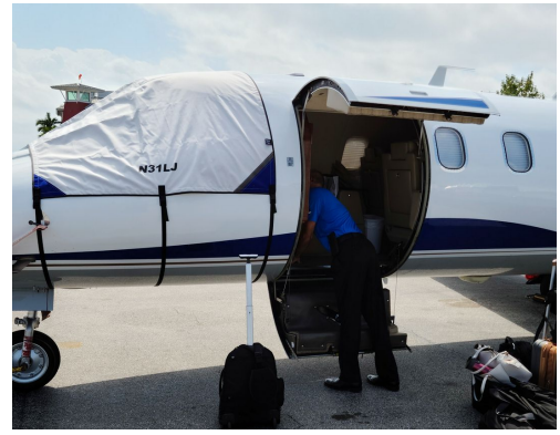
Lear 31A Cockpit Cover