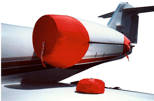
Lear 35 Engine Covers

The Lear 24 & 25 Bikini Style Engine Covers are a single-piece design using a soft and smooth stretchy and fabric. The cover stretches tightly over both the intake and exhaust, installing quickly and easily. These covers are designed to be used as hangar dust covers and have a useful life of approximately one year.