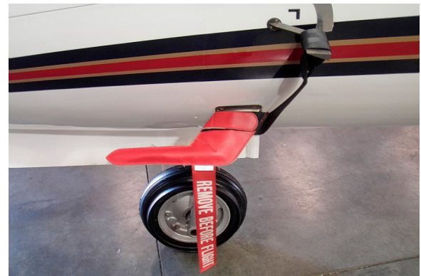
Learjet Heat Resistant Pitot Cover and AOA Strap