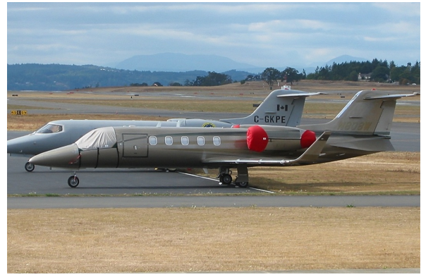
Lear 31A Cockpit Cover, Engine Covers