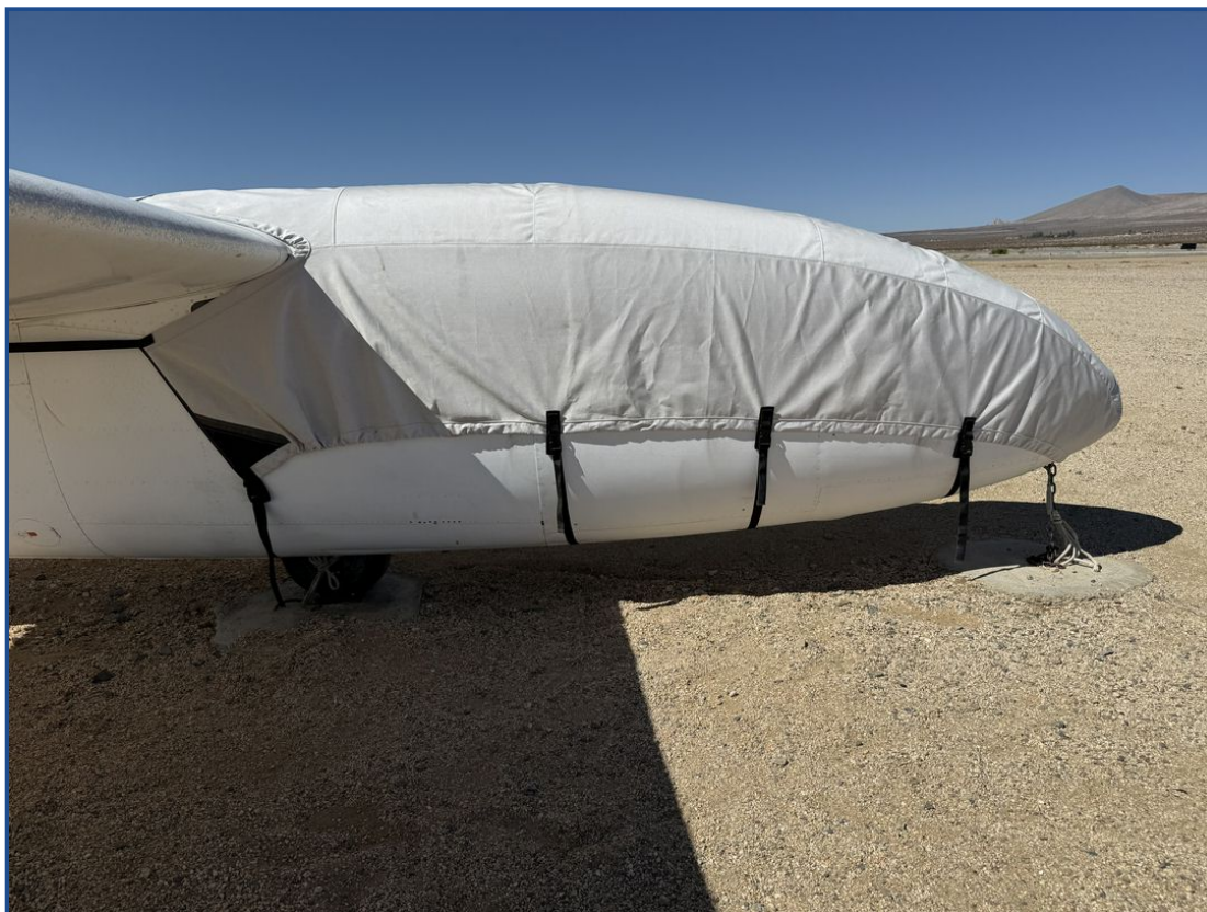
Blanik L-23 Canopy/Nose Cover