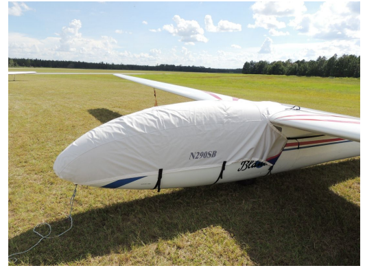
Blanik L23 Canopy/Nose Cover, All Year Use