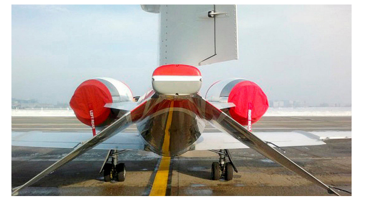
Lear 31 Engine Covers