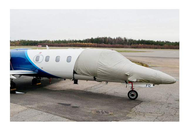
Learjet Cockpit/Nose Cover