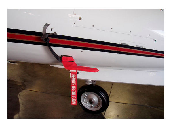
Learjet Heat Resistant Pitot Cover with AOA strap