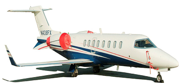
Lear 45 Engine Covers & Pitot/Rosemont Cover set

The Lear Models 40 & 45 Bikini Style Engine Covers are a single-piece design using a soft and smooth stretchy and fabric. The cover stretches tightly over both the intake and exhaust, installing quickly and easily. These covers are designed to be used as hangar dust covers and have a useful life of approximately one year.