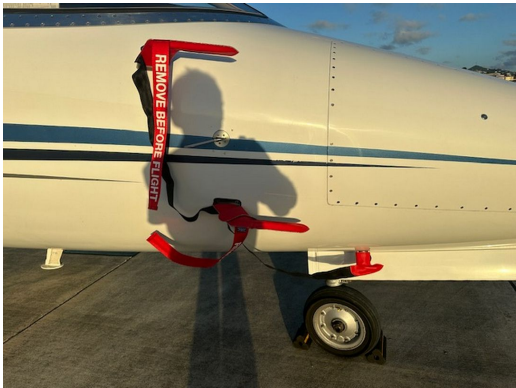
Lear 45 Pitot Cover Set

The Engine Inlet Plugs are custom fit for your Lear Models 40 & 45 intakes, made with heavy-duty vinyl material, and stuffed with a single block of sculpted urethane foam. Each plug has a zipper that allows the foam to be removed and dried if necessary. Engine plugs have 'remove before flight' streamers sewn onto the face of the plugs. Most plugs are imprinted with the aircraft registration number in black for an extra charge. Storage bag NOT included. Engine plugs may be inserted after flight when the engine is still warm. Engine Inlet Plugs are commonly referred to as Cowl Plugs, Intake Plugs, Cowl Blocks, Engine Blocks, and Engine Bungs.