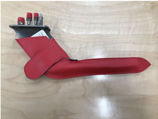
Lear 55 Pitot Cover

The Engine Inlet Plugs are custom fit for your Lear 55 intakes, made with heavy-duty vinyl material, and stuffed with a single block of sculpted urethane foam. Each plug has a zipper that allows the foam to be removed and dried if necessary. Engine plugs have 'remove before flight' streamers sewn onto the face of the plugs. Most plugs are imprinted with the aircraft registration number in black for an extra charge. Storage bag NOT included. Engine plugs may be inserted after flight when the engine is still warm. Engine Inlet Plugs are commonly referred to as Cowl Plugs, Intake Plugs, Cowl Blocks, Engine Blocks, and Engine Bungs.