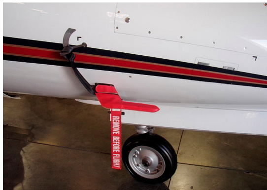
Learjet Heat Resistant Pitot Cover with AOA strap