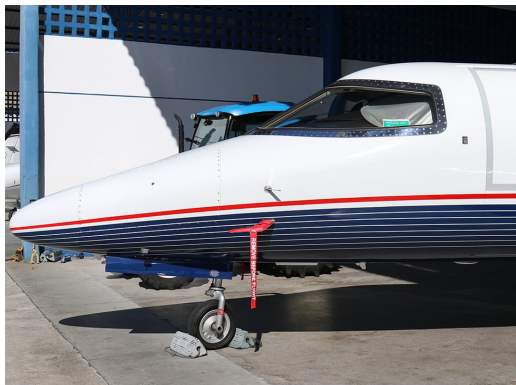
Lear Pitot Cover

The Engine Inlet Plugs are custom fit for your Lear 55 intakes, made with heavy-duty vinyl material, and stuffed with a single block of sculpted urethane foam. Each plug has a zipper that allows the foam to be removed and dried if necessary. Engine plugs have 'remove before flight' streamers sewn onto the face of the plugs. Most plugs are imprinted with the aircraft registration number in black for an extra charge. Storage bag NOT included. Engine plugs may be inserted after flight when the engine is still warm. Engine Inlet Plugs are commonly referred to as Cowl Plugs, Intake Plugs, Cowl Blocks, Engine Blocks, and Engine Bungs.