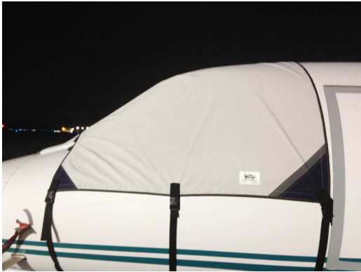
Lear 31 Cockpit Cover