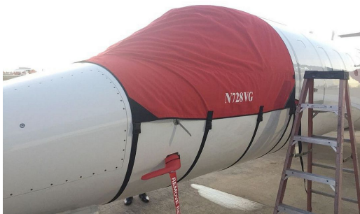
Learjet 45 Cockpit Cover

This cover type is made from Silver Acrylic Sunbrella canvas and is 100% lined with a soft and smooth microfiber. Bruce's Custom Covers developed this material combination especially for aircraft protection. The outer material is medium weight and treated for water resistance, UV resistance and anti-static buildup. The inner lining is a very soft and smooth microfiber to prevent scratching. The material is very reflective, and tests show that the cabin interior temperature can be reduced to near-ambient temperature on the hottest of days. It is water, ice and snow repellent, yet breathable to allow moisture to escape from between the cover and the aircraft surface.