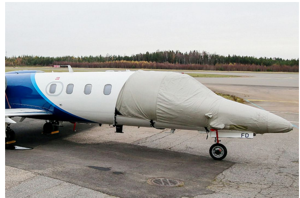
Learjet Cockpit/Nose Cover