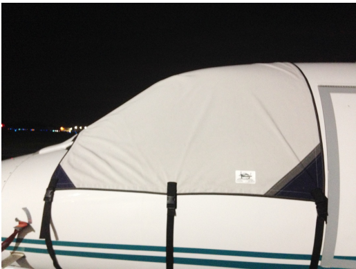
Lear 31 Cockpit Cover