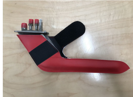
Lear 55 Pitot Cover