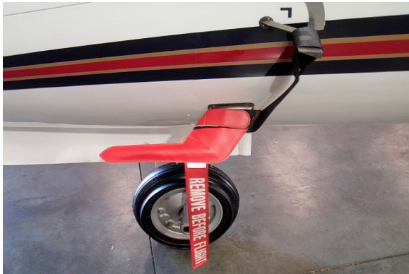
Learjet Heat Resistant Pitot Cover and AOA Strap