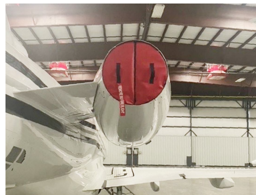
Embraer Legacy 500 Engine Exhaust Plugs, folding type