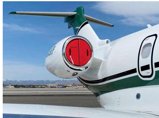
Embraer S A EMB-545 Engine Inlet & Exhaust Plug Set (folding type)