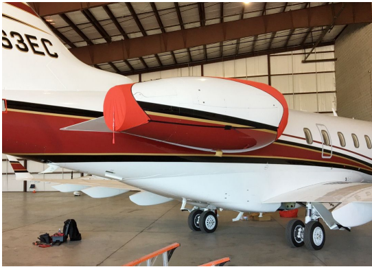
Canadair Challenger 300 Intake/Exhaust Covers, 3-Strap Type