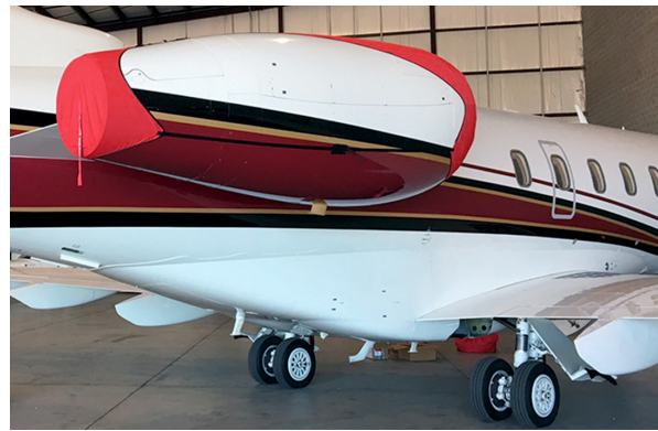
Intake/Exhaust Covers, 3-Strap Type. Successfully installed by two crew, one ladder.