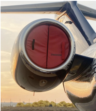
Legacy 500 Folding Intake Plugs