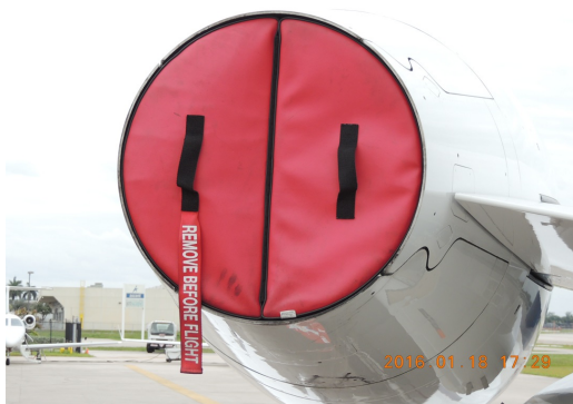
Embraer Legacy 500 Engine Exhaust Plug, folding type

The Engine Inlet Plugs are custom fit for your Embraer Legacy 500 Praetor, (EMB-545/550) intakes, made with heavy-duty vinyl material, and stuffed with a single block of sculpted urethane foam. Each plug has a zipper that allows the foam to be removed and dried if necessary. Engine plugs have 'remove before flight' streamers sewn onto the face of the plugs. Most plugs are imprinted with the aircraft registration number in black for an extra charge. Storage bag NOT included. Engine plugs may be inserted after flight when the engine is still warm. Engine Inlet Plugs are commonly referred to as Cowl Plugs, Intake Plugs, Cowl Blocks, Engine Blocks, and Engine Bungs.