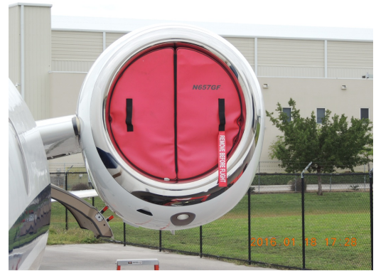
Embraer Legacy 500 Engine Inlet Plug, folding type