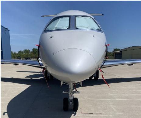
Embraer S A EMB-545 Pitot Cover Set, Cockpit HeatShields

Cockpit Heatshields are interior sunshades for the aircraft's cockpit. The product is a unique composite of closed-cell foam with a silver mylar finish. The semi-rigid design is stiff enough to stand inside the window framing. The set folds up flat and is easily stored in the included storage sleeve. Some designs may require velcro and suction cups. Our Heatshields for jets are offered white side out because some aircraft manufacturers have issued advisories against reflective window inserts due to potential heat damage. A Heatshield is an excellent short-term remedy for cockpit overheating, but an external fabric cover is more effective for long-term protection.