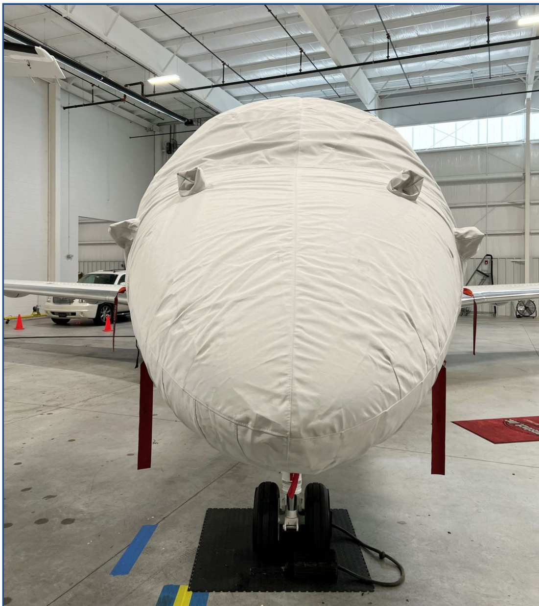
Embraer Legacy 500, (EMB-550) Cockpit/Nose Cover