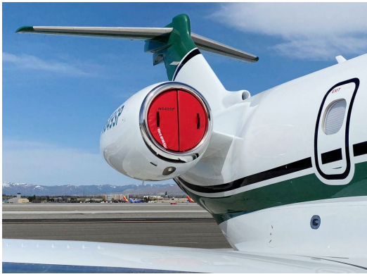
Embraer S A EMB-545 Engine Inlet & Exhaust Plug Set (folding type)

The Engine Inlet Plugs are custom fit for your Embraer Legacy 500 Praetor, (EMB-545/550) intakes, made with heavy-duty vinyl material, and stuffed with a single block of sculpted urethane foam. Each plug has a zipper that allows the foam to be removed and dried if necessary. Engine plugs have 'remove before flight' streamers sewn onto the face of the plugs. Most plugs are imprinted with the aircraft registration number in black for an extra charge. Storage bag NOT included. Engine plugs may be inserted after flight when the engine is still warm. Engine Inlet Plugs are commonly referred to as Cowl Plugs, Intake Plugs, Cowl Blocks, Engine Blocks, and Engine Bungs.