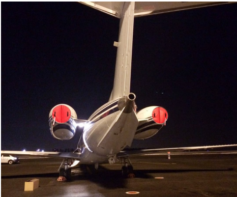
Embraer Legacy Exhaust Plugs

The Engine Inlet Plugs are custom fit for your Embraer Legacy 500 Praetor, (EMB-545/550) intakes, made with heavy-duty vinyl material, and stuffed with a single block of sculpted urethane foam. Each plug has a zipper that allows the foam to be removed and dried if necessary. Engine plugs have 'remove before flight' streamers sewn onto the face of the plugs. Most plugs are imprinted with the aircraft registration number in black for an extra charge. Storage bag NOT included. Engine plugs may be inserted after flight when the engine is still warm. Engine Inlet Plugs are commonly referred to as Cowl Plugs, Intake Plugs, Cowl Blocks, Engine Blocks, and Engine Bungs.