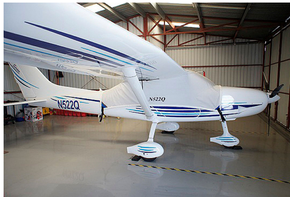
TL Ultralight Sirius Canopy Cover