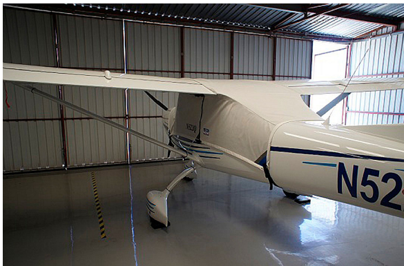
TL Ultralight Sirius Canopy Cover

This cover type is made from Silver Acrylic Sunbrella canvas and is 100% lined with a soft and smooth microfiber. Bruce's Custom Covers developed this material combination especially for aircraft protection. The outer material is medium weight and treated for water resistance, UV resistance and anti-static buildup. The inner lining is a very soft and smooth microfiber to prevent scratching. The material is very reflective, and tests show that the cabin interior temperature can be reduced to near-ambient temperature on the hottest of days. It is water, ice and snow repellent, yet breathable to allow moisture to escape from between the cover and the aircraft surface.