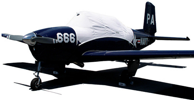
The T34 Canopy Cover

Travel Covers are made with Silver Solution-Dyed Polyester fabric and only lined over the windshield to save weight. The material is lightweight and more compact for easy stowage in the aircraft. The polyester material is water resistant, but only intended for occasional use outside. We also have an ultra lightweight material available for fitted hangar dust covers. For daily outdoor use, the non-travel Sunbrella Cover is the best choice.