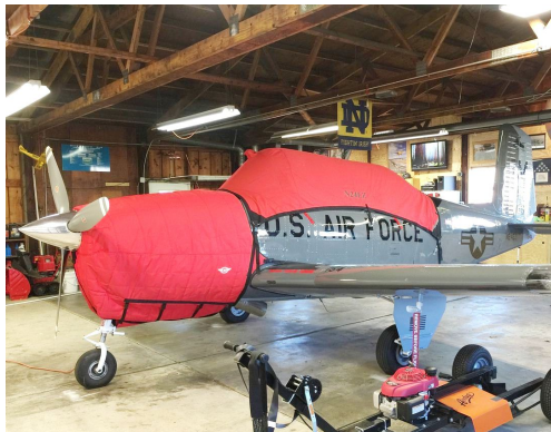
Beech T34 Mentor Canopy Cover, Insulated Engine Cover

This cover type is made from Silver Acrylic Sunbrella canvas and is 100% lined with a soft and smooth microfiber. Bruce's Custom Covers developed this material combination especially for aircraft protection. The outer material is medium weight and treated for water resistance, UV resistance and anti-static buildup. The inner lining is a very soft and smooth microfiber to prevent scratching. The material is very reflective, and tests show that the cabin interior temperature can be reduced to near-ambient temperature on the hottest of days. It is water, ice and snow repellent, yet breathable to allow moisture to escape from between the cover and the aircraft surface.