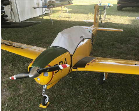
Beechcraft T-34B Mentor Canopy Cover, for 36% Scale Model