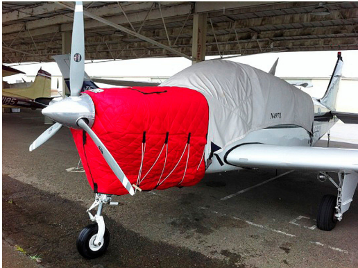
Beech Bonanza Insulated Engine Cover, fully enclosed

This cover type is made from Silver Acrylic Sunbrella canvas and is 100% lined with a soft and smooth microfiber. Bruce's Custom Covers developed this material combination especially for aircraft protection. The outer material is medium weight and treated for water resistance, UV resistance and anti-static buildup. The inner lining is a very soft and smooth microfiber to prevent scratching. The material is very reflective, and tests show that the cabin interior temperature can be reduced to near-ambient temperature on the hottest of days. It is water, ice and snow repellent, yet breathable to allow moisture to escape from between the cover and the aircraft surface.