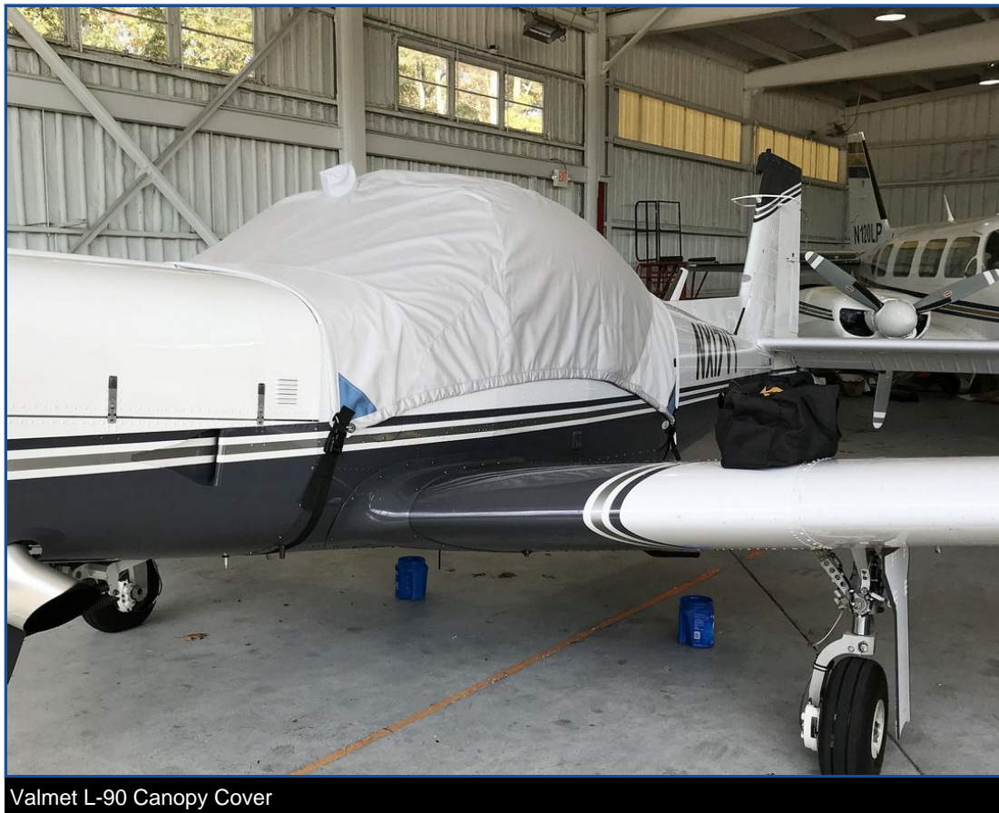
Valmet L-90 Canopy Cover