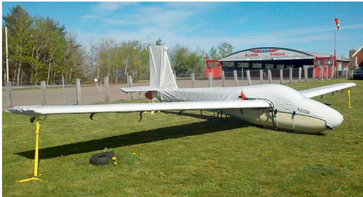
Schweizer 1-26B Canopy/Nose, Empennage & Wing Covers