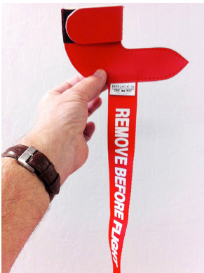
Standard Pitot Cover

Engine Inlet Plugs are custom fit for your Lockheed P-3 Orion intakes, made with heavy-duty vinyl material, and stuffed with a single block of sculpted urethane foam. Each plug has a zipper that allows the foam to be removed and dried if necessary. Engine plugs have warning flags that are visible from the cockpit or 'remove before flight' streamers sewn onto the face of the plugs. Most plugs are imprinted with the aircraft registration number in black for an extra charge. Storage bag NOT included. Engine plugs may be inserted after flight when the engine is still warm. Engine Inlet Plugs are commonly referred to as Cowl Plugs, Intake Plugs, Cowl Blocks, Engine Blocks, and Engine Bungs.