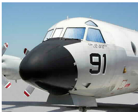
Lockheed P-3 Cockpit HeatShields for P-3 Orion

Cockpit Heatshields are interior sunshades for the aircraft's cockpit. The product is a unique composite of closed-cell foam with a silver mylar finish. The semi-rigid design is stiff enough to stand inside the window framing. The set folds up flat and is easily stored in the included storage sleeve. Some designs may require velcro and suction cups. A Heatshield is an excellent short-term remedy for cockpit overheating, but an external fabric cover is more effective for long-term protection.