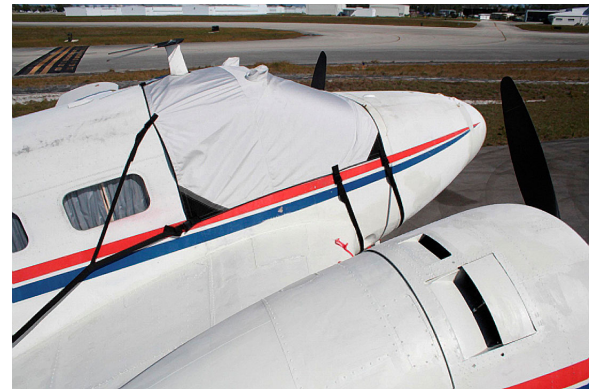
Beech 18 Cockpit Cover