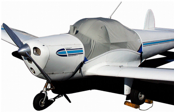
Ercoupe Canopy Cover, bubble windshield model

the Canopy Cover and Engine Cover. This cover will enclose the engine cowl and will extend aft to cover all of the windows. This cover type is made from Silver Acrylic Sunbrella canvas and is 100% lined with a soft and smooth microfiber. Bruce's Custom Covers developed this material combination especially for aircraft protection. The outer material is medium weight and treated for water resistance, UV resistance and anti-static buildup. The inner lining is a very soft and smooth microfiber to prevent scratching. The material is very reflective, and tests show that the cabin interior temperature can be reduced to near-ambient temperature on the hottest of days. It is water, ice and snow repellent, yet breathable to allow moisture to escape from between the cover and the aircraft surface.