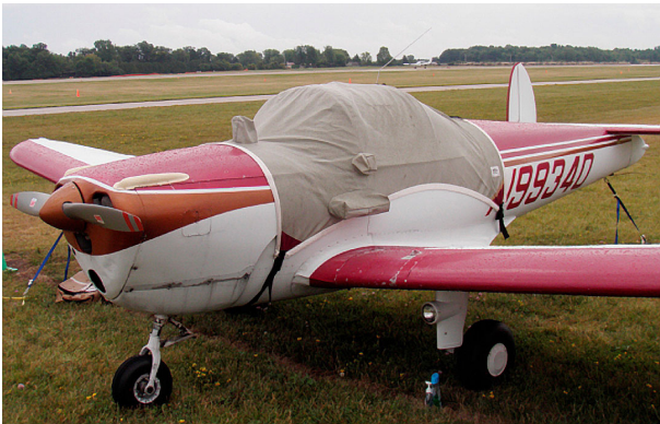
Ercoupe Canopy Cover, flat windshield model