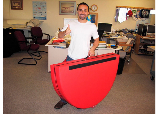
Boeing 737 FOD protection Intake Plug, folding type