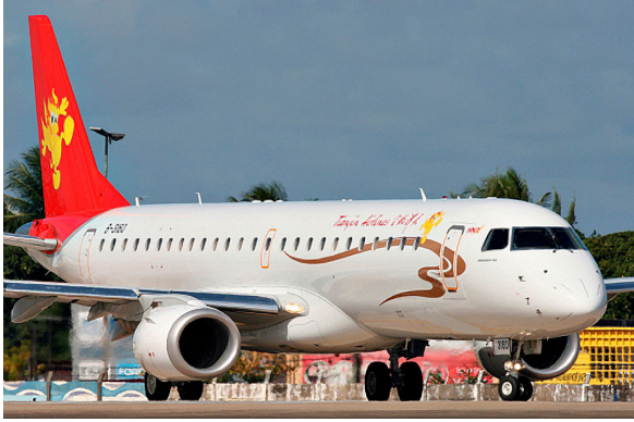
Covers, Plugs & HeatShields for Embraer 170/175/190/195

ALL-YEAR USE MATERIAL - Made with Silver Acrylic Sunbrella canvas, the all-year use material is the best option for sun protection and cover longevity. This heavier more durable material is intended for all weather conditions, such as rain and snow or lots of sun.