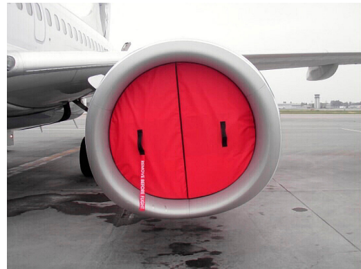
Boeing 737 Engine Intake Plug, Folding Type