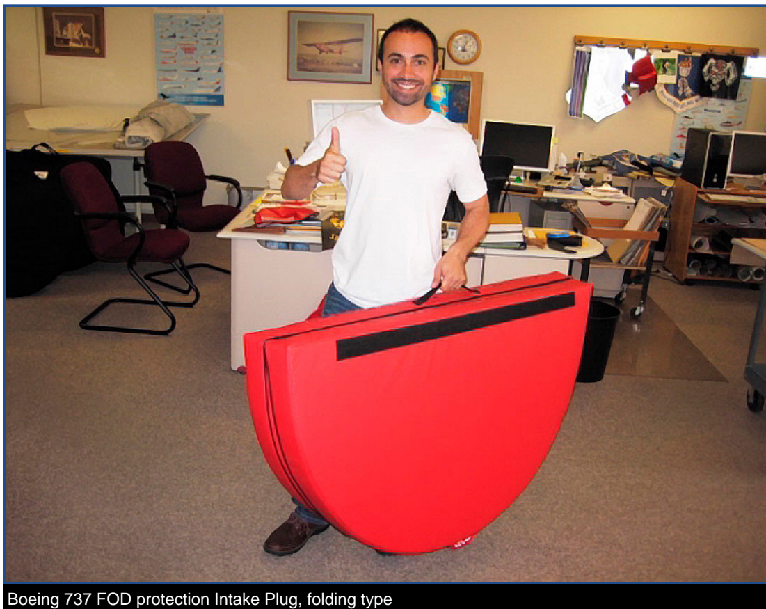
Boeing 737 FOD protection Intake Plug, folding type