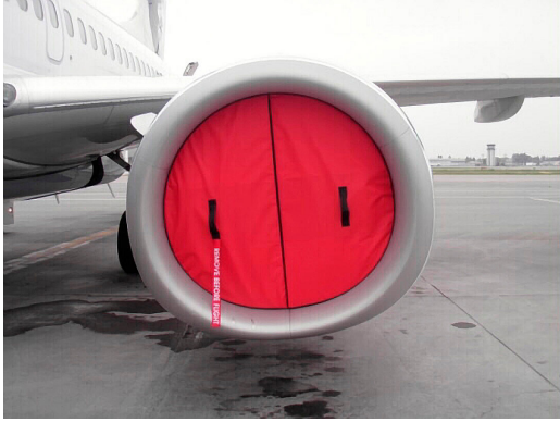
Boeing 737 Engine Intake Plug, Folding Type

ALL-YEAR USE MATERIAL - Made with Silver Acrylic Sunbrella canvas, the all-year use material is the best option for sun protection and cover longevity. This heavier more durable material is intended for all weather conditions, such as rain and snow or lots of sun.