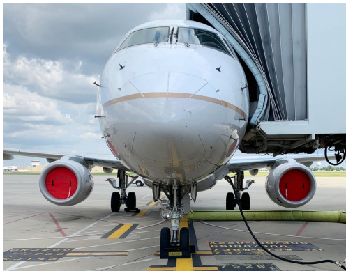
Embraer EMB-170/175 Engine Inlet Plugs

The Engine Inlet Plugs are custom fit for your Embraer EMB-170/175 intakes, made with heavy-duty vinyl material, and stuffed with a single block of sculpted urethane foam. Each plug has a zipper that allows the foam to be removed and dried if necessary. Engine plugs have 'remove before flight' streamers sewn onto the face of the plugs. Most plugs are imprinted with the aircraft registration number in black for an extra charge. Storage bag NOT included. Engine plugs may be inserted after flight when the engine is still warm. Engine Inlet Plugs are commonly referred to as Cowl Plugs, Intake Plugs, Cowl Blocks, Engine Blocks, and Engine Bungs.