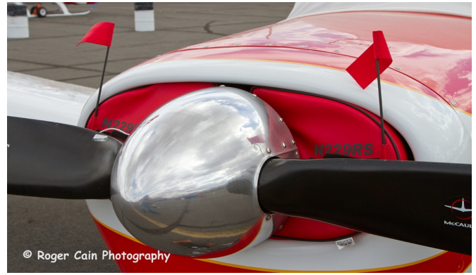
Meyer (Aero Commander) 200 Engine Plugs