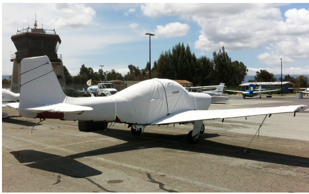
Meyers 200 Complete Cover Set