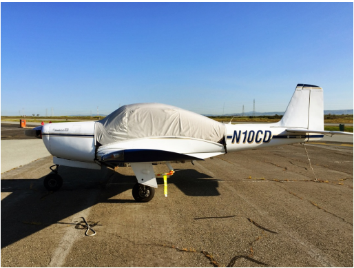
Meyer (Aero Commander) 200 Canopy Cover