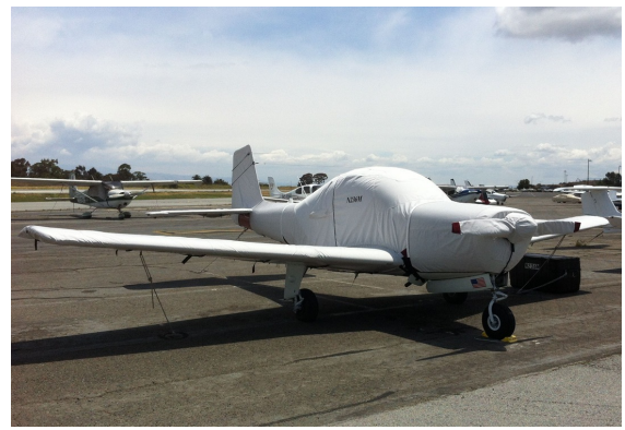
Meyers 200 Complete Cover Set