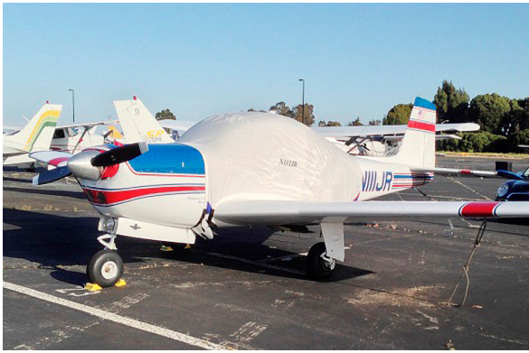
Meyers 200 Extended Canopy Cover & Engine Plugs