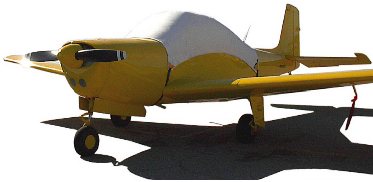
Meyer (Aero Commander) 200 Canopy Cover