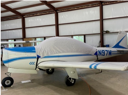
Meyers (Rockwell) 200 Canopy Cover

This cover type is made from Silver Acrylic Sunbrella canvas and is 100% lined with a soft and smooth microfiber. Bruce's Custom Covers developed this material combination especially for aircraft protection. The outer material is medium weight and treated for water resistance, UV resistance and anti-static buildup. The inner lining is a very soft and smooth microfiber to prevent scratching. The material is very reflective, and tests show that the cabin interior temperature can be reduced to near-ambient temperature on the hottest of days. It is water, ice and snow repellent, yet breathable to allow moisture to escape from between the cover and the aircraft surface.