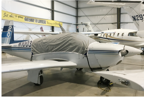
Mooney 201 Travel Cover, Light Weight Travel Canopy Cover, 5 Lbs

Travel Covers are made with Silver Solution-Dyed Polyester fabric and only lined over the windshield to save weight. The material is lightweight and more compact for easy stowage in the aircraft. The polyester material is water resistant, but only intended for occasional use outside. We also have an ultra lightweight material available for fitted hangar dust covers. For daily outdoor use, the non-travel Sunbrella Cover is the best choice.