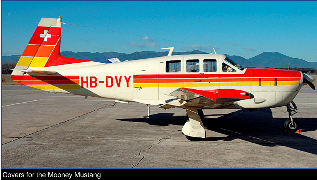
Covers for the Mooney Mustang