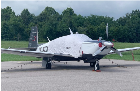
Mooney M20TN Extended Canopy Cover

This cover type is made from Silver Acrylic Sunbrella canvas and is 100% lined with a soft and smooth microfiber. Bruce's Custom Covers developed this material combination especially for aircraft protection. The outer material is medium weight and treated for water resistance, UV resistance and anti-static buildup. The inner lining is a very soft and smooth microfiber to prevent scratching. The material is very reflective, and tests show that the cabin interior temperature can be reduced to near-ambient temperature on the hottest of days. It is water, ice and snow repellent, yet breathable to allow moisture to escape from between the cover and the aircraft surface.