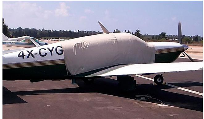
Mooney M20 Extended Canopy Cover