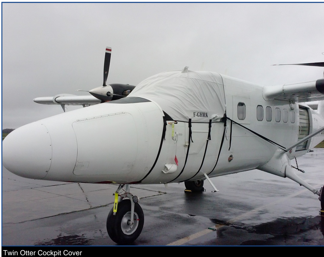
Twin Otter Cockpit Cover