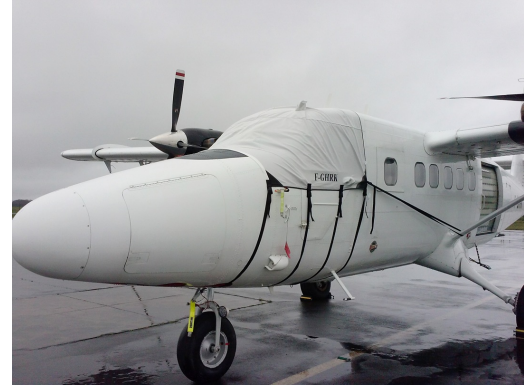
Twin Otter Cockpit Cover