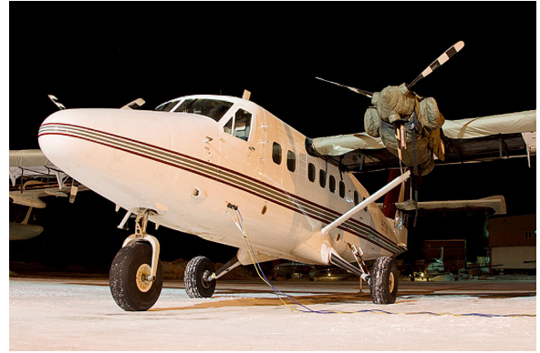
Twin Otter Wing, Horiz. Stab & Engine Covers