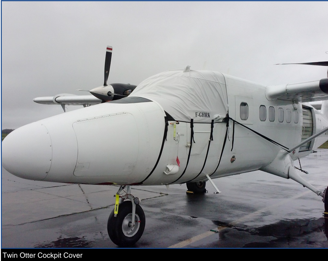
Twin Otter Cockpit Cover