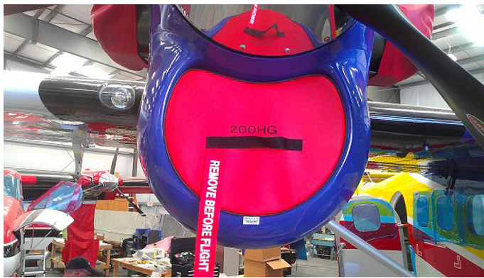
De Havilland Twin Otter Engine Inlet Plug and Exhaust Covers