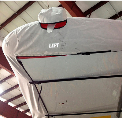
De Havilland Twin Otter Wing Cover wing tip detail

mitigation, or for occasional travel. The material is lighter and more compact, but more susceptible to UV damage and may have a shorter useful life if used continuously outside than the all-year use material.