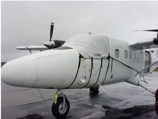
Twin Otter Cockpit Cover

This cover type is made from Silver Acrylic Sunbrella canvas and is 100% lined with a soft and smooth microfiber. Bruce's Custom Covers developed this material combination especially for aircraft protection. The outer material is medium weight and treated for water resistance, UV resistance and anti-static buildup. The inner lining is a very soft and smooth microfiber to prevent scratching. The material is very reflective, and tests show that the cabin interior temperature can be reduced to near-ambient temperature on the hottest of days. It is water, ice and snow repellent, yet breathable to allow moisture to escape from between the cover and the aircraft surface.