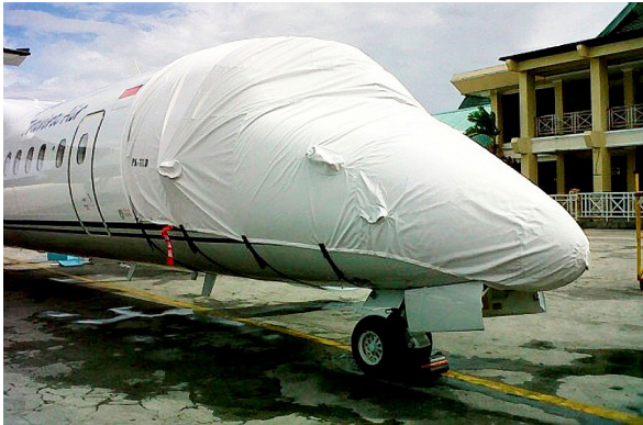
De Havilland Dash 8 Cockpit/Nose Cover