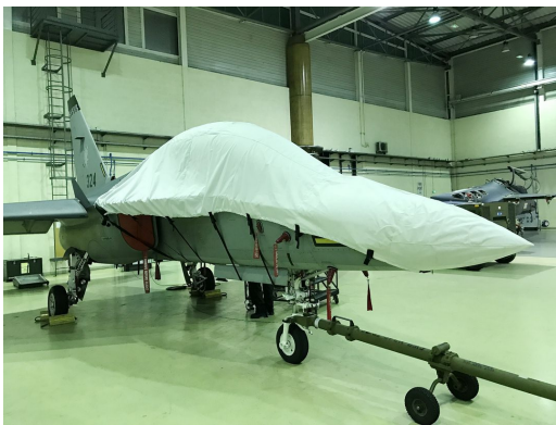
Alenia Aermacchi M-346 Canopy/Nose Cover

This cover type is made from Silver Acrylic Sunbrella canvas and is 100% lined with a soft and smooth microfiber. Bruce's Custom Covers developed this material combination especially for aircraft protection. The outer material is medium weight and treated for water resistance, UV resistance and anti-static buildup. The inner lining is a very soft and smooth microfiber to prevent scratching. The material is very reflective, and tests show that the cabin interior temperature can be reduced to near-ambient temperature on the hottest of days. It is water, ice and snow repellent, yet breathable to allow moisture to escape from between the cover and the aircraft surface.