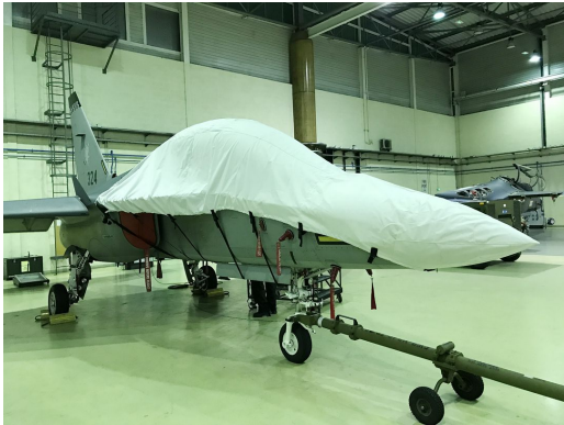
Alenia Aermacchi M-346 Canopy/Nose Cover

This cover type is made from Silver Acrylic Sunbrella canvas and is 100% lined with a soft and smooth microfiber. Bruce's Custom Covers developed this material combination especially for aircraft protection. The outer material is medium weight and treated for water resistance, UV resistance and anti-static buildup. The inner lining is a very soft and smooth microfiber to prevent scratching. The material is very reflective, and tests show that the cabin interior temperature can be reduced to near-ambient temperature on the hottest of days. It is water, ice and snow repellent, yet breathable to allow moisture to escape from between the cover and the aircraft surface.