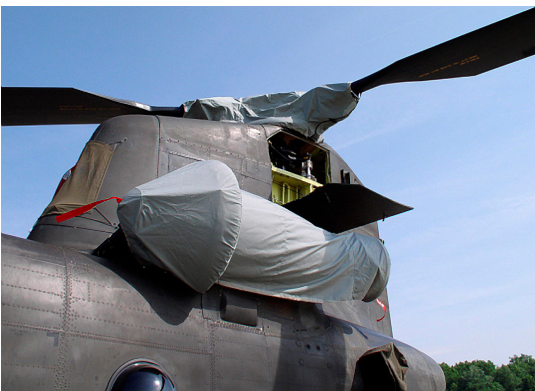
Boeing Vertol CH-47 Engine and Rotor Hub Covers

Insulated Covers Material - A special composite material of solution-dyed polyester, 3M Thinsulate insulation, and soft nylon interior fabric. Our insulated covers are designed to complement an engine preheater and help retain heat in the engine compartment after shutdown. If you operate your aircraft in cold-weather, these covers will help prevent engine wear and tear.