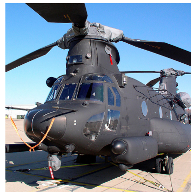
Boeing Vertol MH-47 Rotor Hubs, Engine & Other Covers