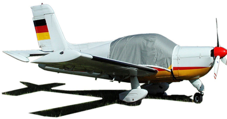
Rallye 150 Canopy Cover