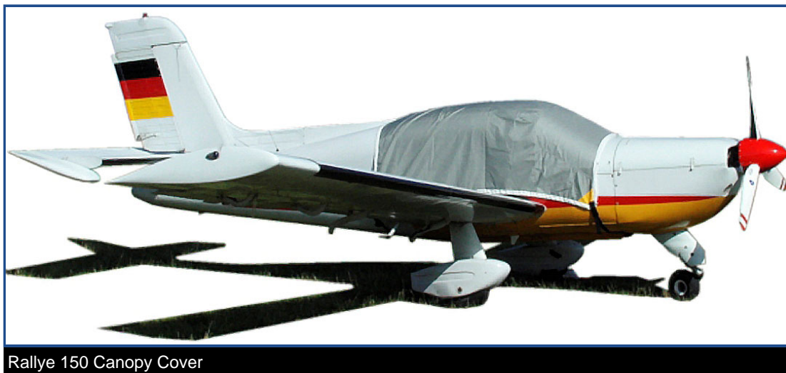
Rallye 150 Canopy Cover