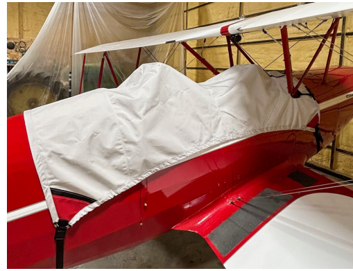
Marquardt Charger MA-5 Cockpit Cover