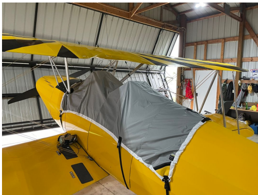
Marquardt Charger Travel Weight Canopy Cover

This cover type is made from Silver Acrylic Sunbrella canvas and is 100% lined with a soft and smooth microfiber. Bruce's Custom Covers developed this material combination especially for aircraft protection. The outer material is medium weight and treated for water resistance, UV resistance and anti-static buildup. The inner lining is a very soft and smooth microfiber to prevent scratching. The material is very reflective, and tests show that the cabin interior temperature can be reduced to near-ambient temperature on the hottest of days. It is water, ice and snow repellent, yet breathable to allow moisture to escape from between the cover and the aircraft surface.