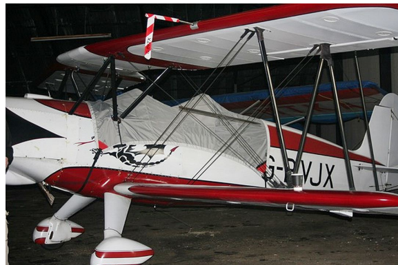
Marquardt Charger MA-5 Light Weight Travel Cockpit Cover