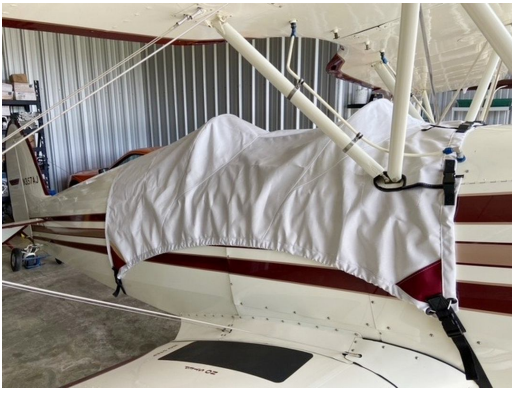
Marquardt Charger Cockpit Cover