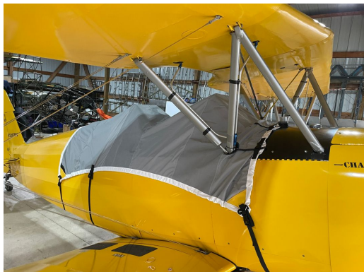
Marquardt Charger Travel Weight Canopy Cover

This cover type is made from Silver Acrylic Sunbrella canvas and is 100% lined with a soft and smooth microfiber. Bruce's Custom Covers developed this material combination especially for aircraft protection. The outer material is medium weight and treated for water resistance, UV resistance and anti-static buildup. The inner lining is a very soft and smooth microfiber to prevent scratching. The material is very reflective, and tests show that the cabin interior temperature can be reduced to near-ambient temperature on the hottest of days. It is water, ice and snow repellent, yet breathable to allow moisture to escape from between the cover and the aircraft surface.