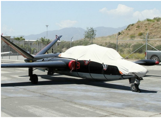
Fougas Magister Canopy/Nose Cover with nose mount loop antenna