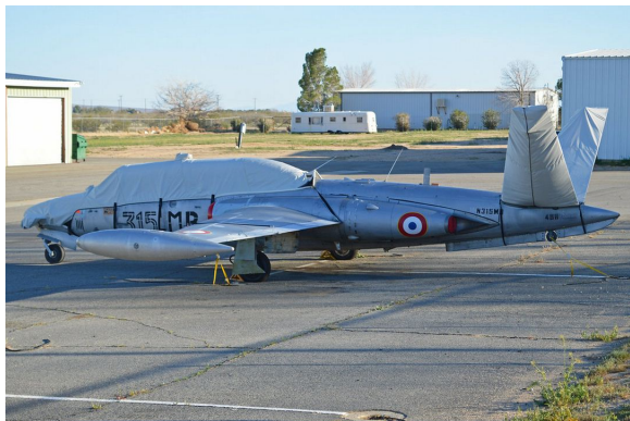
Fouga Magister Canopy/Nose Cover, Tail Stabilizer Covers

This cover type is made from Silver Acrylic Sunbrella canvas and is 100% lined with a soft and smooth microfiber. Bruce's Custom Covers developed this material combination especially for aircraft protection. The outer material is medium weight and treated for water resistance, UV resistance and anti-static buildup. The inner lining is a very soft and smooth microfiber to prevent scratching. The material is very reflective, and tests show that the cabin interior temperature can be reduced to near-ambient temperature on the hottest of days. It is water, ice and snow repellent, yet breathable to allow moisture to escape from between the cover and the aircraft surface.