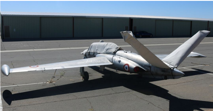
Fougas Magister Canopy/Nose Cover, Tail Stabilizer Covers

WINTER USE MATERIAL - Made with Solution-Dyed Polyester fabric, this option is intended for seasonal use to aid in deicing, rain mitigation, or for occasional travel. The material is lighter and more compact, but more susceptible to UV damage and may have a shorter useful life if used continuously outside than the all-year use material.