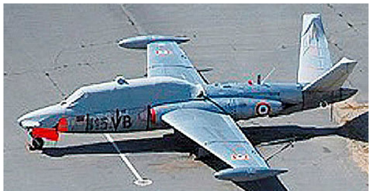
Fouga Magister Canopy/Nose & Stabilizer Covers