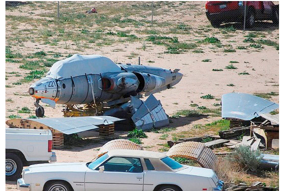
Fouga Magister Canopy Cover