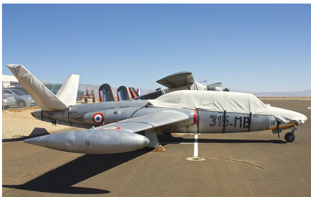
Fouga Magister Canopy/Nose Cover, Tail Stabilizer Covers

WINTER USE MATERIAL - Made with Solution-Dyed Polyester fabric, this option is intended for seasonal use to aid in deicing, rain mitigation, or for occasional travel. The material is lighter and more compact, but more susceptible to UV damage and may have a shorter useful life if used continuously outside than the all-year use material.