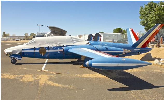
Fouga Magister Canopy/Nose Cover

Travel Covers are made with Silver Solution-Dyed Polyester fabric and only lined over the windshield to save weight. The material is lightweight and more compact for easy stowage in the aircraft. The polyester material is water resistant, but only intended for occasional use outside. We also have an ultra lightweight material available for fitted hangar dust covers. For daily outdoor use, the non-travel Sunbrella Cover is the best choice.