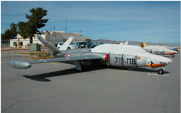
Fougas Magister Canopy/Nose Cover & Tail Stabilizer Covers