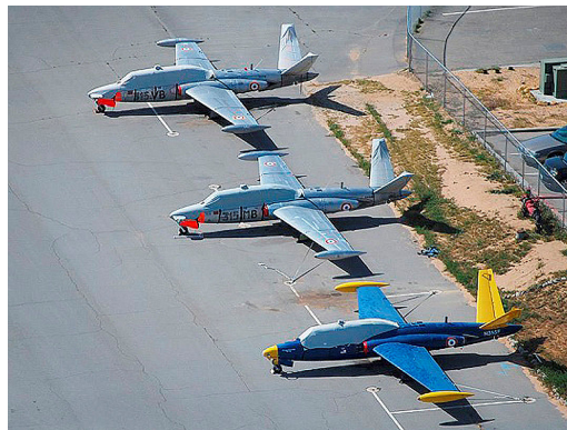
Fouga Magister Canopy Cover, Canopy/Nose Covers and Tail Stabilizer Covers