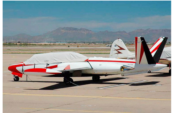
Fouga Magister Canopy Cover