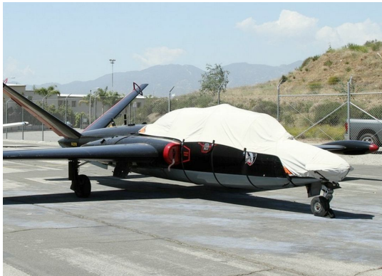
Fouga Magister Canopy/Nose Cover with nose mount loop antenna