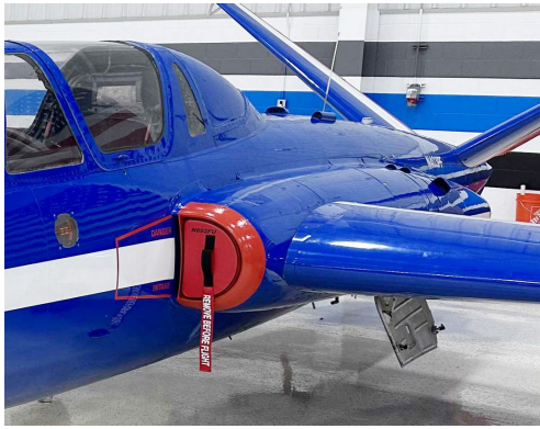
Fougas Magister CM170 Intake Plugs