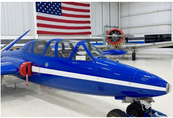
Fouga Magister CM170 Intake Plugs