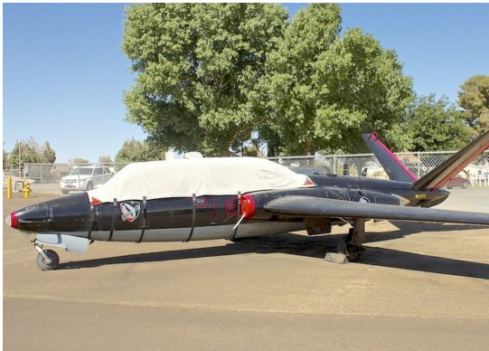
Fouga Magister Canopy Cover, Engine Plugs