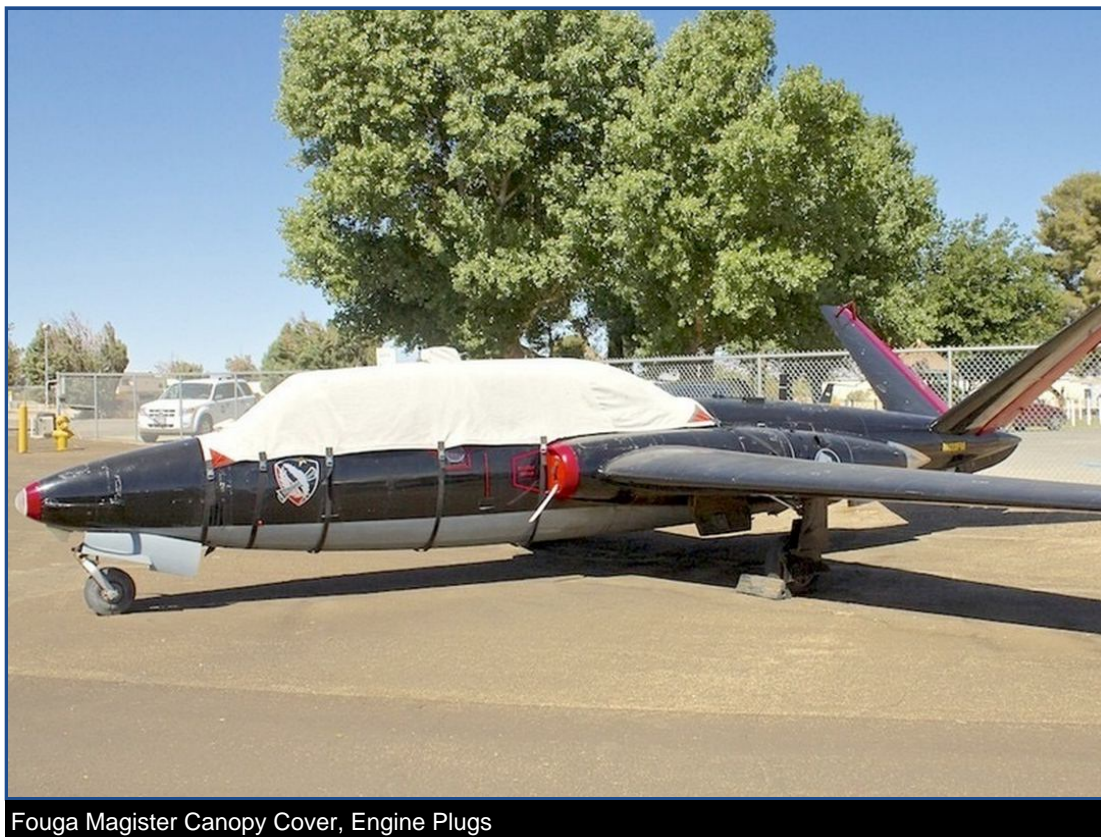
Fouga Magister Canopy Cover, Engine Plugs