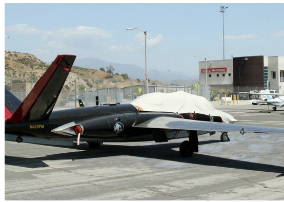
Fouga Magister Canopy/Nose Cover with nose mount loop antenna