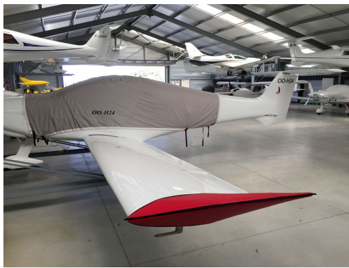
Dynaero MCR.4 Pickup Canopy Cover, Wingtip Pads