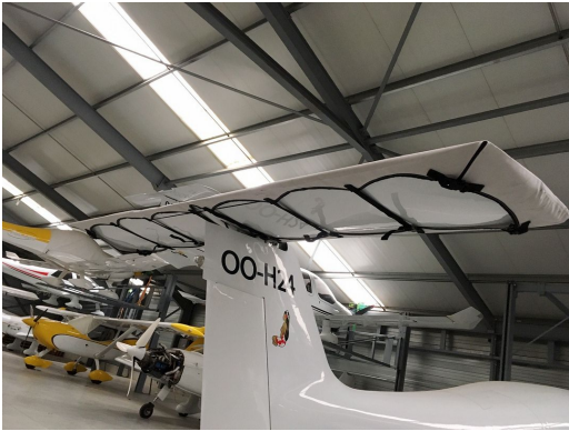
Dynaero MCR Horizontal Stabilizer Cover

WINTER USE MATERIAL - Made with Solution-Dyed Polyester fabric, this option is intended for seasonal use to aid in deicing, rain mitigation, or for occasional travel. The material is lighter and more compact, but more susceptible to UV damage and may have a shorter useful life if used continuously outside than the all-year use material.