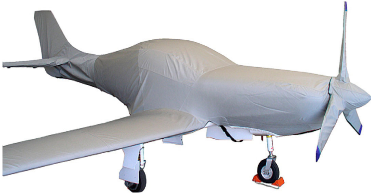
Lancair 320 Complete Fuselage/Wing Cover & Prop Cover