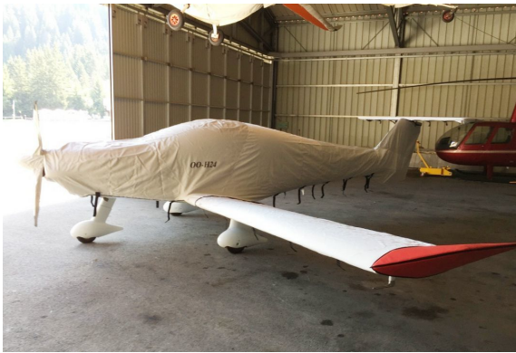
Dynaero MCR.4 Pickup Complete Cover Set.

This cover type is made from Silver Acrylic Sunbrella canvas and is 100% lined with a soft and smooth microfiber. Bruce's Custom Covers developed this material combination especially for aircraft protection. The outer material is medium weight and treated for water resistance, UV resistance and anti-static buildup. The inner lining is a very soft and smooth microfiber to prevent scratching. The material is very reflective, and tests show that the cabin interior temperature can be reduced to near-ambient temperature on the hottest of days. It is water, ice and snow repellent, yet breathable to allow moisture to escape from between the cover and the aircraft surface.