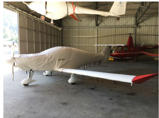
Dynaero MCR.4 Pickup Complete Cover Set.