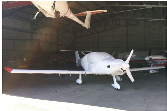
Dynaero MCR.4 Pickup Complete Cover Set.