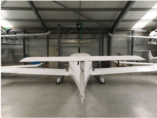
Dynaero MCR Horizontal Stabilizer Cover

WINTER USE MATERIAL - Made with Solution-Dyed Polyester fabric, this option is intended for seasonal use to aid in deicing, rain mitigation, or for occasional travel. The material is lighter and more compact, but more susceptible to UV damage and may have a shorter useful life if used continuously outside than the all-year use material.