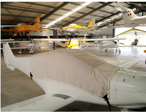
Dynaero MCR Pickup Canopy Cover

This cover type is made from Silver Acrylic Sunbrella canvas and is 100% lined with a soft and smooth microfiber. Bruce's Custom Covers developed this material combination especially for aircraft protection. The outer material is medium weight and treated for water resistance, UV resistance and anti-static buildup. The inner lining is a very soft and smooth microfiber to prevent scratching. The material is very reflective, and tests show that the cabin interior temperature can be reduced to near-ambient temperature on the hottest of days. It is water, ice and snow repellent, yet breathable to allow moisture to escape from between the cover and the aircraft surface.