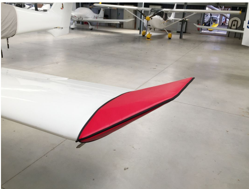
Dynaero MCR Pickup Wingtip Pads

Designed to prevent damage to the aircraft extremities in crowded hangars, these products are made of bright red Naugahyde and thickly padded with a sandwich of closed cell foam.