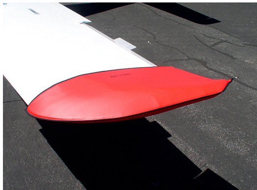
Cessna 350/400 Wingtip Pads

Designed to prevent damage to the aircraft extremities in crowded hangars, these products are made of bright red Naugahyde and thickly padded with a sandwich of closed cell foam.