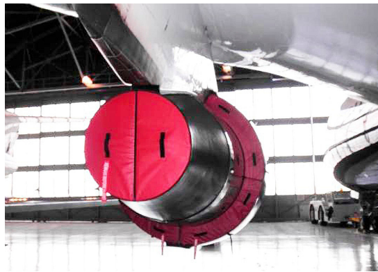
DC-10 Bypass Vent, Exhaust Plug set