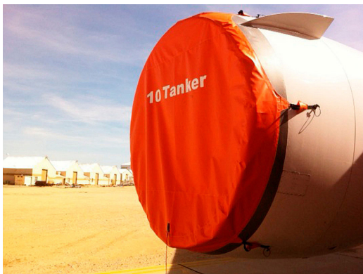
DC-10-30 Intake Cover (CF650C2 Engine)