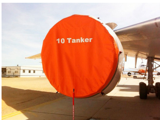
DC-10 Intake Cover