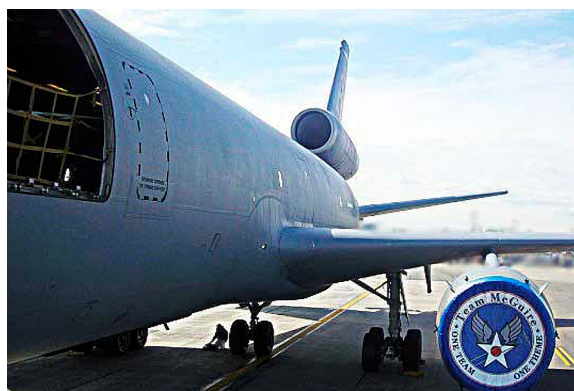
KC-10 Intake Cover at McGuire AFB, NJ