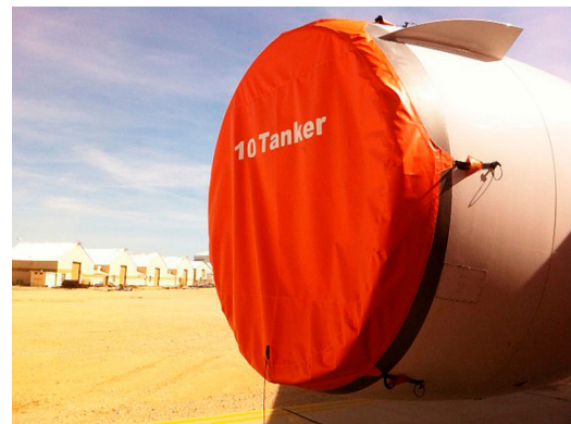
DC-10-30 Intake Cover (CF650C2 Engine)