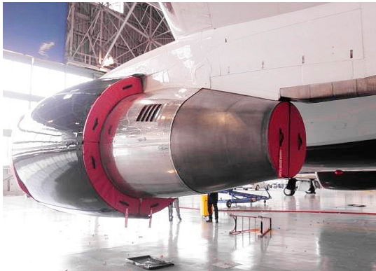
DC-10 Bypass Vent, Exhaust Plug set Exhaust Plugs Ship Set, incl. Fan Thrust Reverser and Exhaust Plugs P/N: B767-200