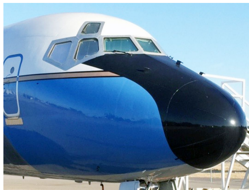
McDonnell Douglas MD80 Cockpit Heatshield Set