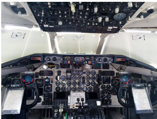
McDonnell Douglas MD80 Cockpit Heatshield Set