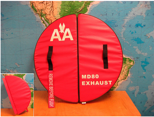
MD-80 Exhaust Plug, folding type

material, and stuffed with a single block of sculpted urethane foam. Each plug has a zipper that allows the foam to be removed and dried if necessary. Engine plugs have 'remove before flight' streamers sewn onto the face of the plugs. Most plugs are imprinted with the aircraft registration number in black for an extra charge. Storage bag NOT included. Engine plugs may be inserted after flight when the engine is still warm. Engine Inlet Plugs are commonly referred to as Cowl Plugs, Intake Plugs, Cowl Blocks, Engine Blocks, and Engine Bungs.