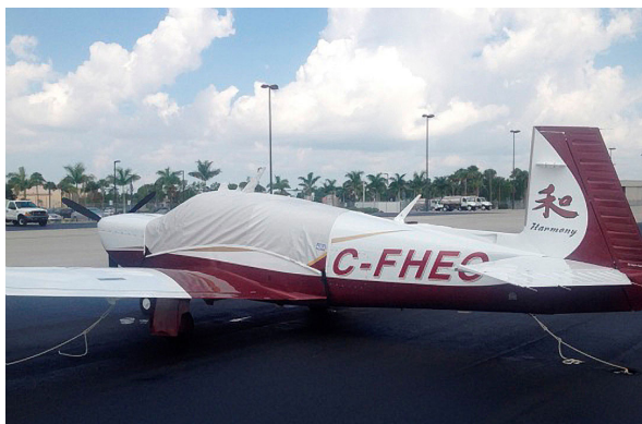
Mooney TLS Canopy Cover

Travel Covers are made with Silver Solution-Dyed Polyester fabric and only lined over the windshield to save weight. The material is lightweight and more compact for easy stowage in the aircraft. The polyester material is water resistant, but only intended for occasional use outside. We also have an ultra lightweight material available for fitted hangar dust covers. For daily outdoor use, the non-travel Sunbrella Cover is the best choice.