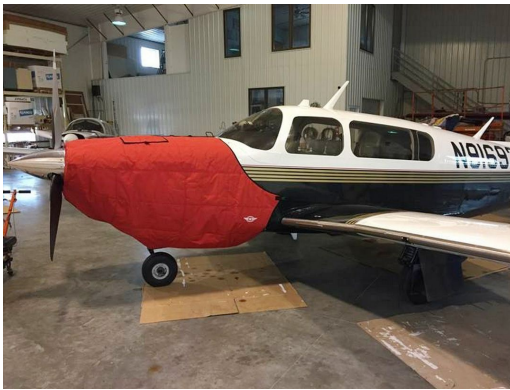
Mooney Ovation Insulated Engine Cover

This cover type is made from Silver Acrylic Sunbrella canvas and is 100% lined with a soft and smooth microfiber. Bruce's Custom Covers developed this material combination especially for aircraft protection. The outer material is medium weight and treated for water resistance, UV resistance and anti-static buildup. The inner lining is a very soft and smooth microfiber to prevent scratching. The material is very reflective, and tests show that the cabin interior temperature can be reduced to near-ambient temperature on the hottest of days. It is water, ice and snow repellent, yet breathable to allow moisture to escape from between the cover and the aircraft surface.