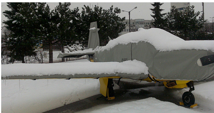
Mooney 231 Full Cover Set, doing its job in the Austrian Winter

WINTER USE MATERIAL - Made with Solution-Dyed Polyester fabric, this option is intended for seasonal use to aid in deicing, rain mitigation, or for occasional travel. The material is lighter and more compact, but more susceptible to UV damage and may have a shorter useful life if used continuously outside than the all-year use material.