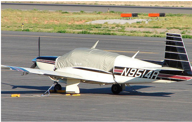
Mooney 201 Canopy Cover

This cover type is made from Silver Acrylic Sunbrella canvas and is 100% lined with a soft and smooth microfiber. Bruce's Custom Covers developed this material combination especially for aircraft protection. The outer material is medium weight and treated for water resistance, UV resistance and anti-static buildup. The inner lining is a very soft and smooth microfiber to prevent scratching. The material is very reflective, and tests show that the cabin interior temperature can be reduced to near-ambient temperature on the hottest of days. It is water, ice and snow repellent, yet breathable to allow moisture to escape from between the cover and the aircraft surface.