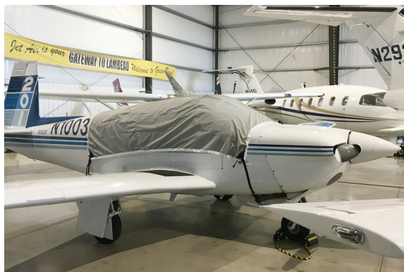
Mooney 201 Travel Cover, Light Weight Travel Canopy Cover, 5 Lbs