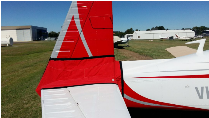
Mooney M20J Tailcone Cover

WINTER USE MATERIAL - Made with Solution-Dyed Polyester fabric, this option is intended for seasonal use to aid in deicing, rain mitigation, or for occasional travel. The material is lighter and more compact, but more susceptible to UV damage and may have a shorter useful life if used continuously outside than the all-year use material.