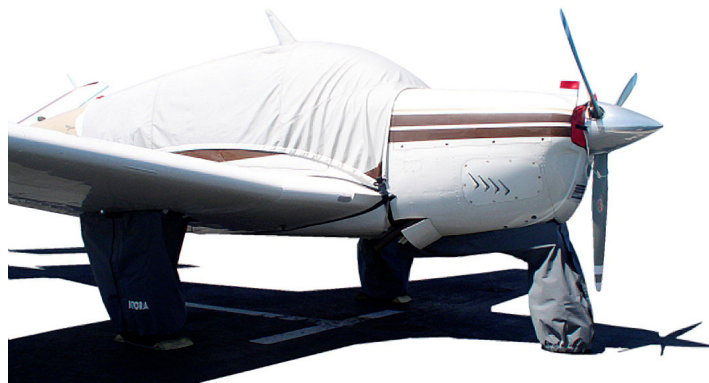
Beech Bonanza/Debonair/Baron Landing Gear Covers