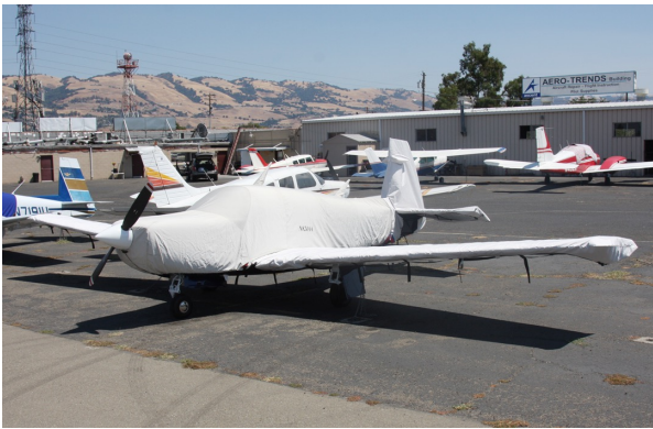
Mooney 231 Full Cover Set

This cover type is made from Silver Acrylic Sunbrella canvas and is 100% lined with a soft and smooth microfiber. Bruce's Custom Covers developed this material combination especially for aircraft protection. The outer material is medium weight and treated for water resistance, UV resistance and anti-static buildup. The inner lining is a very soft and smooth microfiber to prevent scratching. The material is very reflective, and tests show that the cabin interior temperature can be reduced to near-ambient temperature on the hottest of days. It is water, ice and snow repellent, yet breathable to allow moisture to escape from between the cover and the aircraft surface.