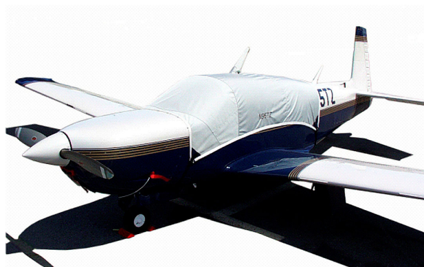
Porsche Mooney Canopy Cover & Plugs