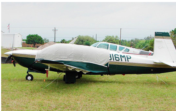
Mooney Ovation Canopy Cover

Travel Covers are made with Silver Solution-Dyed Polyester fabric and only lined over the windshield to save weight. The material is lightweight and more compact for easy stowage in the aircraft. The polyester material is water resistant, but only intended for occasional use outside. We also have an ultra lightweight material available for fitted hangar dust covers. For daily outdoor use, the non-travel Sunbrella Cover is the best choice.