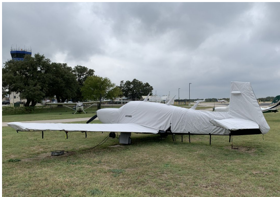
Mooney M20M Bravo Cover Set