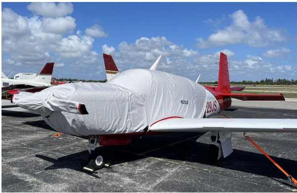
Mooney M20K Extended Canopy/Engine Cover, Prop Cover