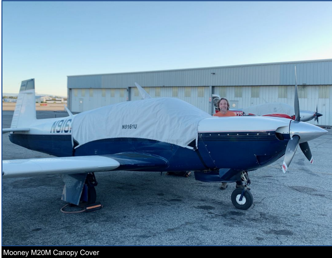
Mooney M20M Canopy Cover