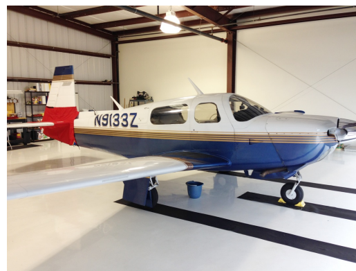
Mooney Tailcone Cover