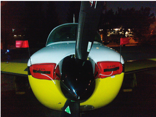
Mooney 231 Engine Inlet Plugs

Engine Inlet Plugs are custom fit for your Mooney Eagle intakes, made with heavy-duty vinyl material, and stuffed with a single block of sculpted urethane foam. Each plug has a zipper that allows the foam to be removed and dried if necessary. Engine plugs have warning flags that are visible from the cockpit or 'remove before flight' streamers sewn onto the face of the plugs. Most plugs are imprinted with the aircraft registration number in black for an extra charge. Storage bag NOT included. Engine plugs may be inserted after flight when the engine is still warm. Engine Inlet Plugs are commonly referred to as Cowl Plugs, Intake Plugs, Cowl Blocks, Engine Blocks, and Engine Bungs.