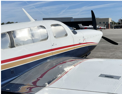
Mooney M20S Heatshield Set

Heatshields are interior sunshades for an aircraft's windows or canopy glass. The product is a unique composite of closed-cell foam with a silver mylar finish. The semi-rigid design is stiff enough to stand along the inside of the windshield using sun visors or window framing. It folds up flat and easily stores in the included storage sleeve. Some designs may require velcro and suction cups. A Heatshield is an excellent short-term remedy for cockpit overheating.