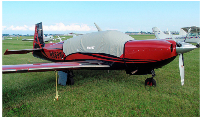
Mooney Acclaim Canopy Cover