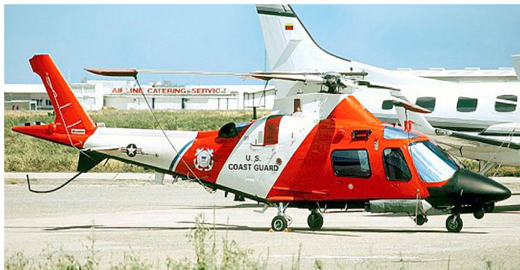
Covers, Plugs, HeatShields and related items for the Agusta MH-68A

Heatshields are interior sunshades for an aircraft's windows or canopy glass. The product is a unique composite of closed-cell foam with a silver mylar finish. The semi-rigid design is stiff enough to stand along the inside of the windshield using sun visors or window framing. It folds up flat and easily stores in the included storage sleeve. Some designs may require velcro and suction cups. A Heatshield is an excellent short-term remedy for cockpit overheating.