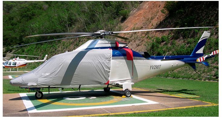
Agusta Grand Bubble Cover