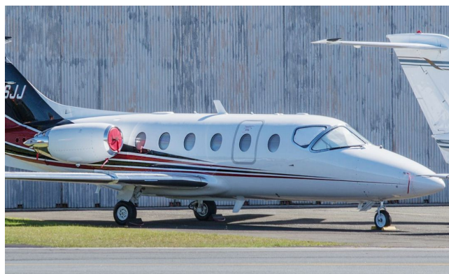
Beechjet Engine Plugs and Cockpit Heatshields