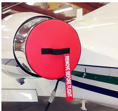
Cessna Citation S2 Exhaust Plugs