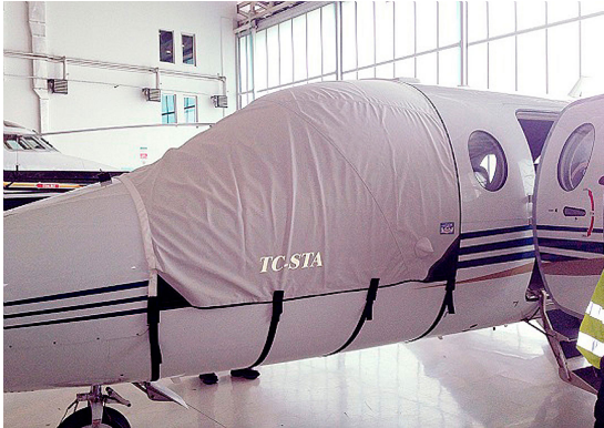
Beechjet 400A Cockpit Cover

This cover type is made from Silver Acrylic Sunbrella canvas and is 100% lined with a soft and smooth microfiber. Bruce's Custom Covers developed this material combination especially for aircraft protection. The outer material is medium weight and treated for water resistance, UV resistance and anti-static buildup. The inner lining is a very soft and smooth microfiber to prevent scratching. The material is very reflective, and tests show that the cabin interior temperature can be reduced to near-ambient temperature on the hottest of days. It is water, ice and snow repellent, yet breathable to allow moisture to escape from between the cover and the aircraft surface.