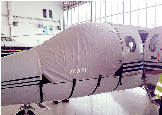
Beechjet 400A Cockpit Cover

This cover type is made from Silver Acrylic Sunbrella canvas and is 100% lined with a soft and smooth microfiber. Bruce's Custom Covers developed this material combination especially for aircraft protection. The outer material is medium weight and treated for water resistance, UV resistance and anti-static buildup. The inner lining is a very soft and smooth microfiber to prevent scratching. The material is very reflective, and tests show that the cabin interior temperature can be reduced to near-ambient temperature on the hottest of days. It is water, ice and snow repellent, yet breathable to allow moisture to escape from between the cover and the aircraft surface.