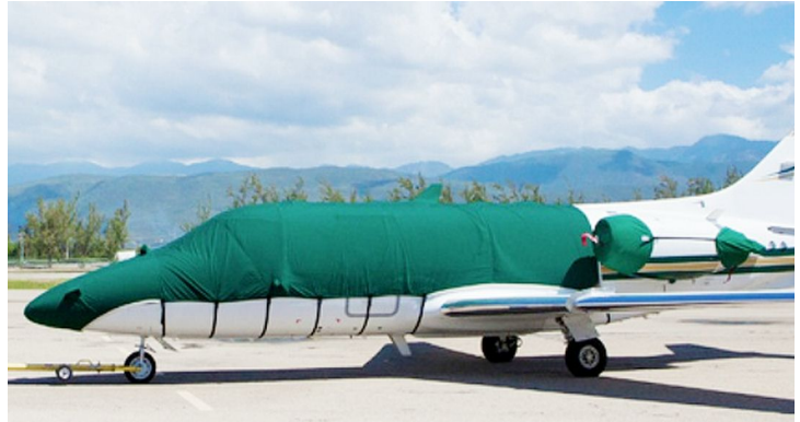
Raytheon Beechjet 400 Fuselage/Nose Cover, Engine Covers