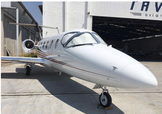
Beechjet Cockpit Heatshields

Cockpit Heatshields are interior sunshades for the aircraft's cockpit. The product is a unique composite of closed-cell foam with a silver mylar finish. The semi-rigid design is stiff enough to stand inside the window framing. The set folds up flat and is easily stored in the included storage sleeve. Some designs may require velcro and suction cups. Our Heatshields for jets are offered white side out because some aircraft manufacturers have issued advisories against reflective window inserts due to potential heat damage. A Heatshield is an excellent short-term remedy for cockpit overheating, but an external fabric cover is more effective for long-term protection.