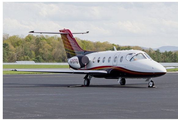
Nextant 400XTi Cockpit HeatShields, Bikini Type Engine Covers