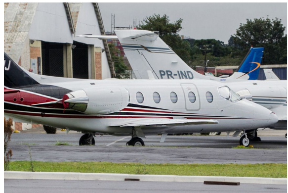
Beechjet Engine Plugs and Cockpit Heatshields