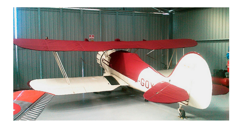
Cessna 140 Canopy, Wings, Prop, Tires & Empennage Waco UPF-7 Upper Wing Cover, Horizontal Stabilizer Cover & Canopy Cover