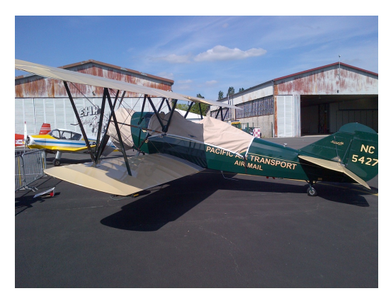
Travelair 4000 Canopy and Engine Cover

This cover type is made from Silver Acrylic Sunbrella canvas and is 100% lined with a soft and smooth microfiber. Bruce's Custom Covers developed this material combination especially for aircraft protection. The outer material is medium weight and treated for water resistance, UV resistance and anti-static buildup. The inner lining is a very soft and smooth microfiber to prevent scratching. The material is very reflective, and tests show that the cabin interior temperature can be reduced to near-ambient temperature on the hottest of days. It is water, ice and snow repellent, yet breathable to allow moisture to escape from between the cover and the aircraft surface.