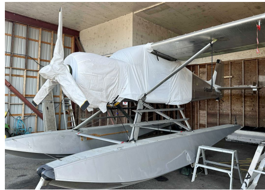
Murphy Moose Extended Canopy Cover, Engine & Prop Covers, test fit covers.