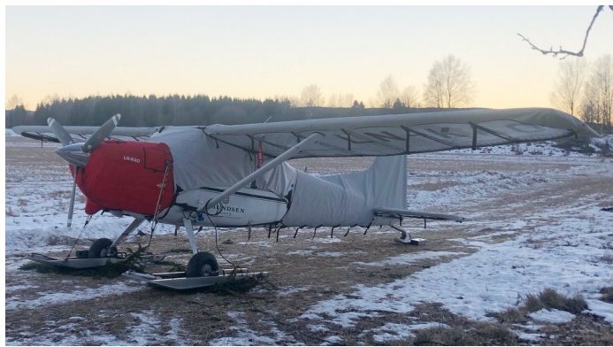
Cessna A185E Winter Cover Set