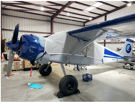
Murphy Moose Travel Weight Canopy Cover

This cover type is made from Silver Acrylic Sunbrella canvas and is 100% lined with a soft and smooth microfiber. Bruce's Custom Covers developed this material combination especially for aircraft protection. The outer material is medium weight and treated for water resistance, UV resistance and anti-static buildup. The inner lining is a very soft and smooth microfiber to prevent scratching. The material is very reflective, and tests show that the cabin interior temperature can be reduced to near-ambient temperature on the hottest of days. It is water, ice and snow repellent, yet breathable to allow moisture to escape from between the cover and the aircraft surface.