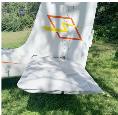
Murphy Elite Horizontal Stabilizer Covers