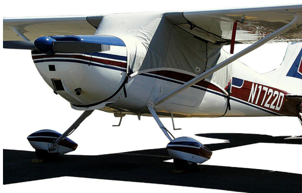
Over-the-Top Canopy Cover

This cover type is made from Silver Acrylic Sunbrella canvas and is 100% lined with a soft and smooth microfiber. Bruce's Custom Covers developed this material combination especially for aircraft protection. The outer material is medium weight and treated for water resistance, UV resistance and anti-static buildup. The inner lining is a very soft and smooth microfiber to prevent scratching. The material is very reflective, and tests show that the cabin interior temperature can be reduced to near-ambient temperature on the hottest of days. It is water, ice and snow repellent, yet breathable to allow moisture to escape from between the cover and the aircraft surface.