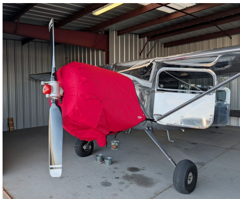
Murphy Moose Insulated Engine Cover

This cover type is made from Silver Acrylic Sunbrella canvas and is 100% lined with a soft and smooth microfiber. Bruce's Custom Covers developed this material combination especially for aircraft protection. The outer material is medium weight and treated for water resistance, UV resistance and anti-static buildup. The inner lining is a very soft and smooth microfiber to prevent scratching. The material is very reflective, and tests show that the cabin interior temperature can be reduced to near-ambient temperature on the hottest of days. It is water, ice and snow repellent, yet breathable to allow moisture to escape from between the cover and the aircraft surface.