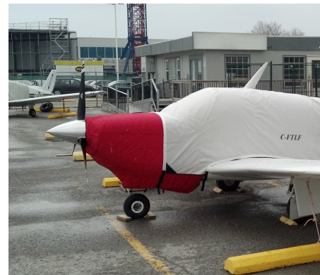
Mooney 201 Insulated Engine Cover, fully enclosed