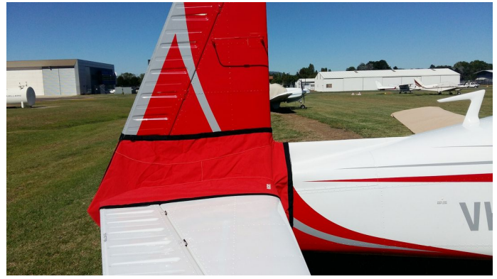
Mooney M20J Tailcone Cover