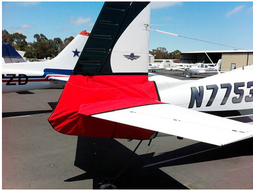
Mooney Tailcone Cover, completely enclosed