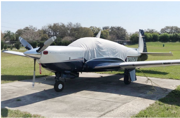
Mooney Ovation Canopy Cover