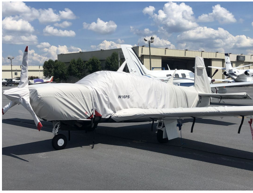
Mooney M20TN Acclaim Full Cover Set