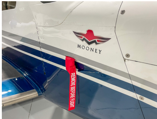
Mooney NACA Plug

Engine Inlet Plugs are custom fit for your Mooney Ovation & Ovation Ultra intakes, made with heavy-duty vinyl material, and stuffed with a single block of sculpted urethane foam. Each plug has a zipper that allows the foam to be removed and dried if necessary. Engine plugs have warning flags that are visible from the cockpit or 'remove before flight' streamers sewn onto the face of the plugs. Most plugs are imprinted with the aircraft registration number in black for an extra charge. Storage bag NOT included. Engine plugs may be inserted after flight when the engine is still warm. Engine Inlet Plugs are commonly referred to as Cowl Plugs, Intake Plugs, Cowl Blocks, Engine Blocks, and Engine Bungs.