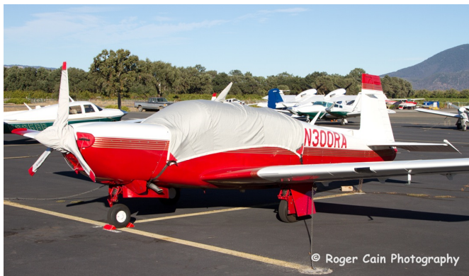
Mooney M20M Bravo Canopy Cover, 3-Blade Prop Cover

This cover type is made from Silver Acrylic Sunbrella canvas and is 100% lined with a soft and smooth microfiber. Bruce's Custom Covers developed this material combination especially for aircraft protection. The outer material is medium weight and treated for water resistance, UV resistance and anti-static buildup. The inner lining is a very soft and smooth microfiber to prevent scratching. The material is very reflective, and tests show that the cabin interior temperature can be reduced to near-ambient temperature on the hottest of days. It is water, ice and snow repellent, yet breathable to allow moisture to escape from between the cover and the aircraft surface.