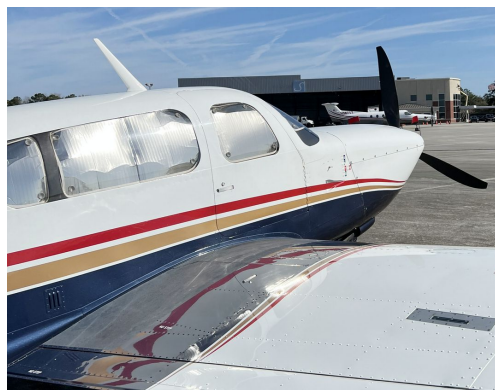
Mooney M20S Heatshield Set

Windshield Heatshields are interior sunshades for an aircraft's front windshield. The product is a unique composite of closed-cell foam with a silver mylar finish. The semi-rigid design is stiff enough to stand along the inside of the windshield using sun visors or window framing. It folds up flat and easily stores in the included storage sleeve. Some designs may require velcro and suction cups or split right and left sides. A Heatshield is an excellent short-term remedy for cockpit overheating. An external fabric cover is far more effective and practical for long-term protection.