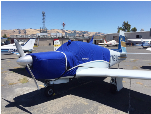
Mooney M20 Canopy & Engine Cover

This cover type is made from Silver Acrylic Sunbrella canvas and is 100% lined with a soft and smooth microfiber. Bruce's Custom Covers developed this material combination especially for aircraft protection. The outer material is medium weight and treated for water resistance, UV resistance and anti-static buildup. The inner lining is a very soft and smooth microfiber to prevent scratching. The material is very reflective, and tests show that the cabin interior temperature can be reduced to near-ambient temperature on the hottest of days. It is water, ice and snow repellent, yet breathable to allow moisture to escape from between the cover and the aircraft surface.