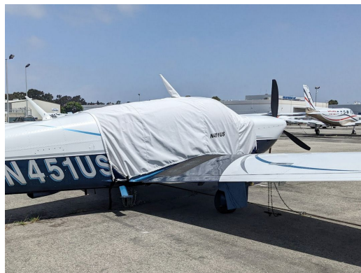
Mooney Ovation Extended Canopy Cover