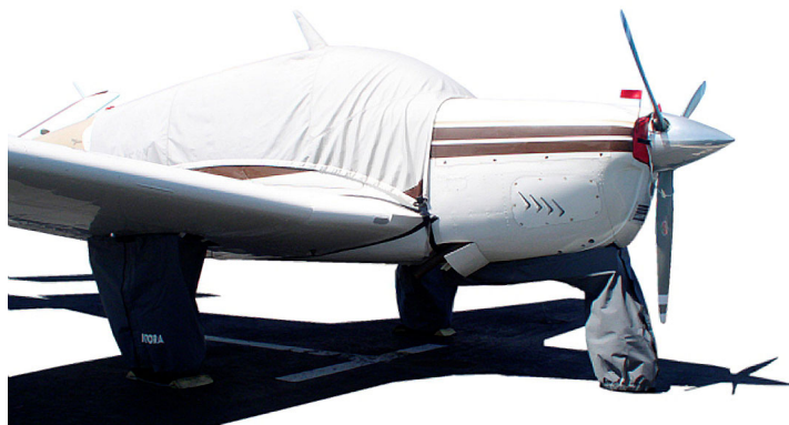
Beech Bonanza/Debonair/Baron Landing Gear Covers