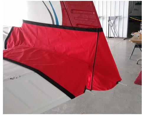
Mooney Tailcone Cover