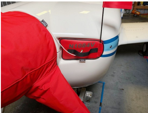
Mooney Engine Inlet Plug & Prop Cover

This cover type is made from Silver Acrylic Sunbrella canvas and is 100% lined with a soft and smooth microfiber. Bruce's Custom Covers developed this material combination especially for aircraft protection. The outer material is medium weight and treated for water resistance, UV resistance and anti-static buildup. The inner lining is a very soft and smooth microfiber to prevent scratching. The material is very reflective, and tests show that the cabin interior temperature can be reduced to near-ambient temperature on the hottest of days. It is water, ice and snow repellent, yet breathable to allow moisture to escape from between the cover and the aircraft surface.