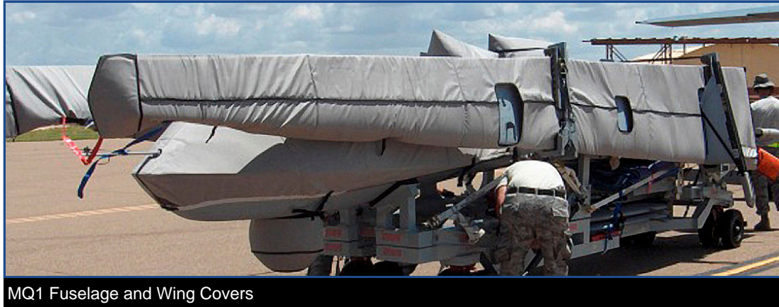
MQ1 Fuselage and Wing Covers