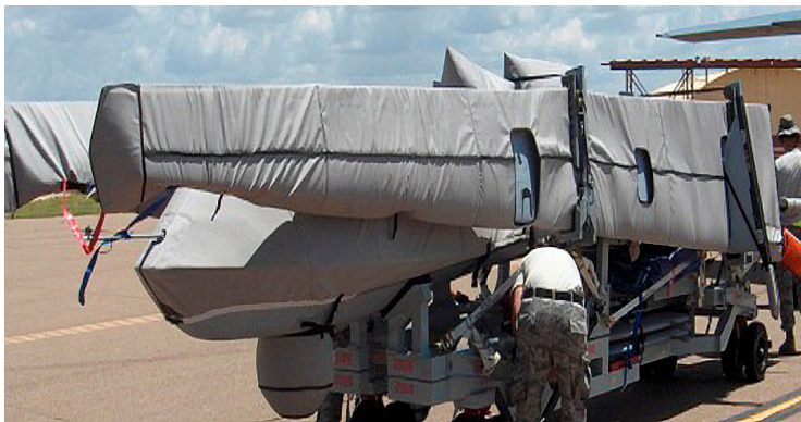
MQ1 Fuselage and Wing Covers

WINTER USE MATERIAL - Made with Solution-Dyed Polyester fabric, this option is intended for seasonal use to aid in deicing, rain mitigation, or for occasional travel. The material is lighter and more compact, but more susceptible to UV damage and may have a shorter useful life if used continuously outside than the all-year use material.