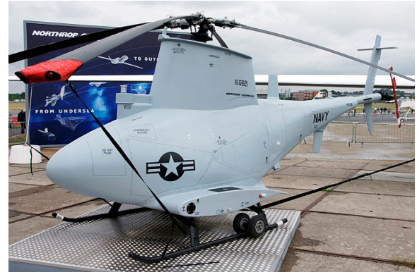
Northrup Grumman MQ-8 Firescout Blade Tie-Downs