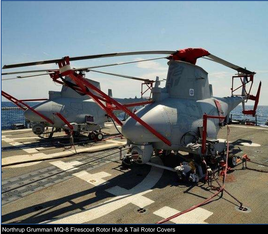
Northrop Grumman MQ-8 Firescout Rotor Hub &amp; Tail Rotor Covers