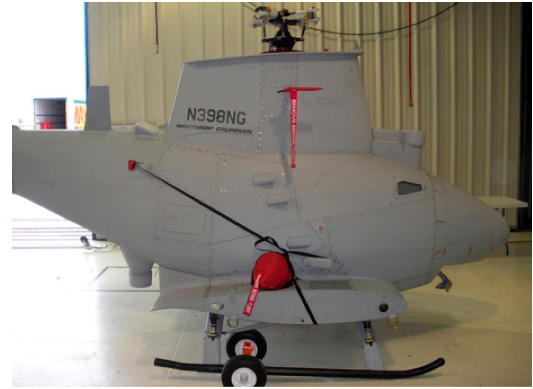
Covers & Plugs for the Northrop Grumman MQ-8 Fire Scout