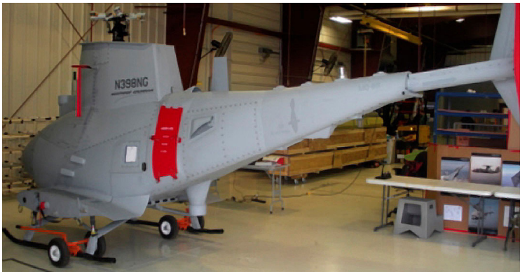
Covers & Plugs for the Northrop Grumman MQ-8 Fire Scout