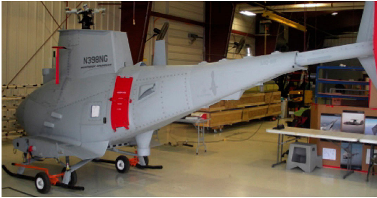
Covers & Plugs for the Northrop Grumman MQ-8 Fire Scout

necessary. Engine plugs have 'Remove Before Flight' streamers sewn onto the face of the plugs. Most plugs are imprinted with the aircraft registration number in black for an extra charge. Storage bag NOT included. Engine plugs may be inserted after flight when the engine is still warm. Engine Inlet Plugs are commonly referred to as Cowl Plugs, Intake Plugs, Cowl Blocks, Engine Blocks, and Engine Bunges.